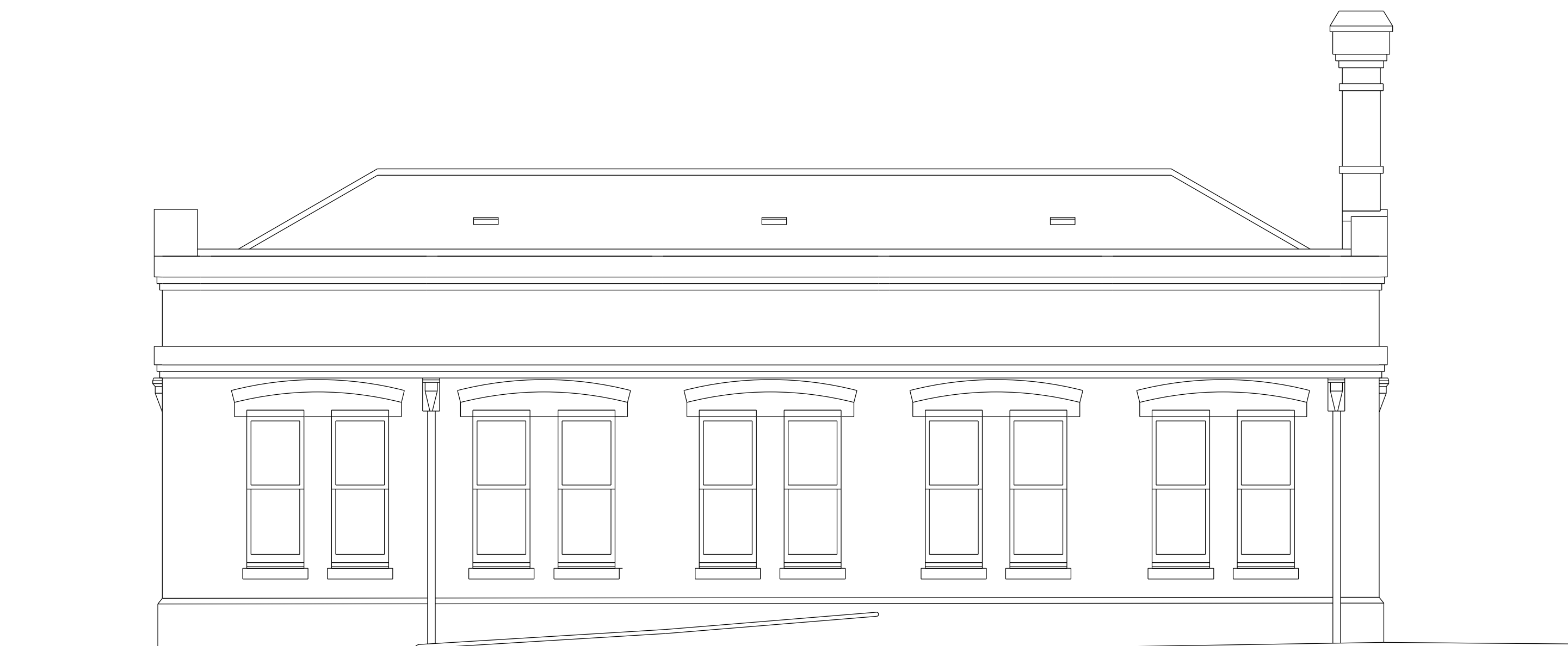
3 NORTH ELEVATION 1:50