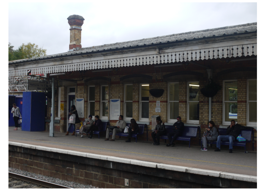
Existing Platform 4 Building

Notes 1. ALL DIMENSIONS ARE IN MILLIMETRES UNLESS OTHERWISE STATED.