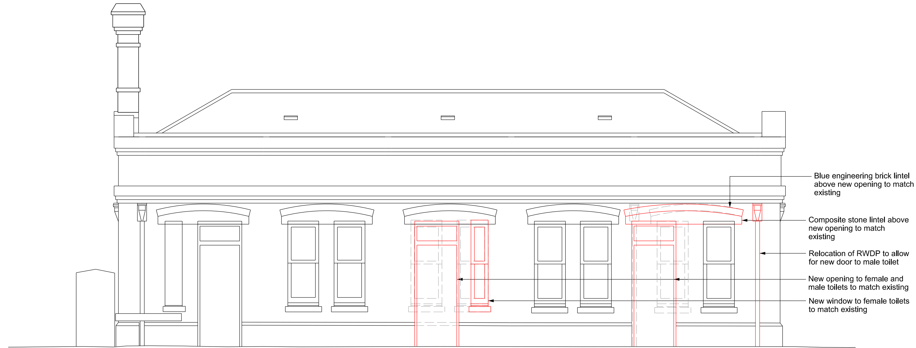
1 SOUTH ELEVATION 1:50