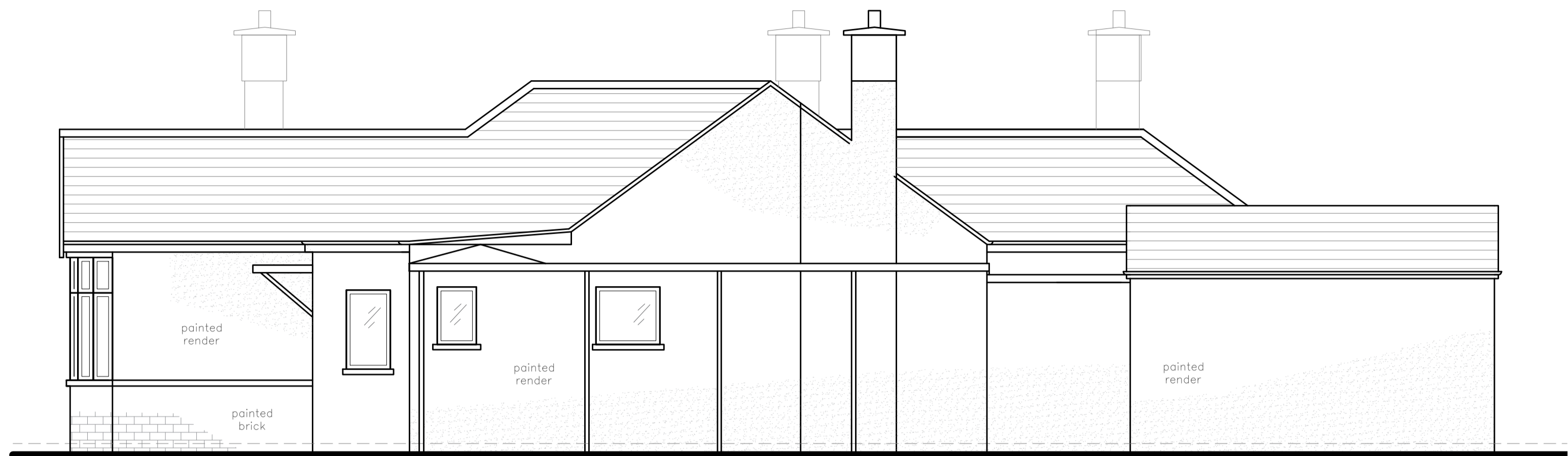
SIDE ELEVATION SCALE: 1:50