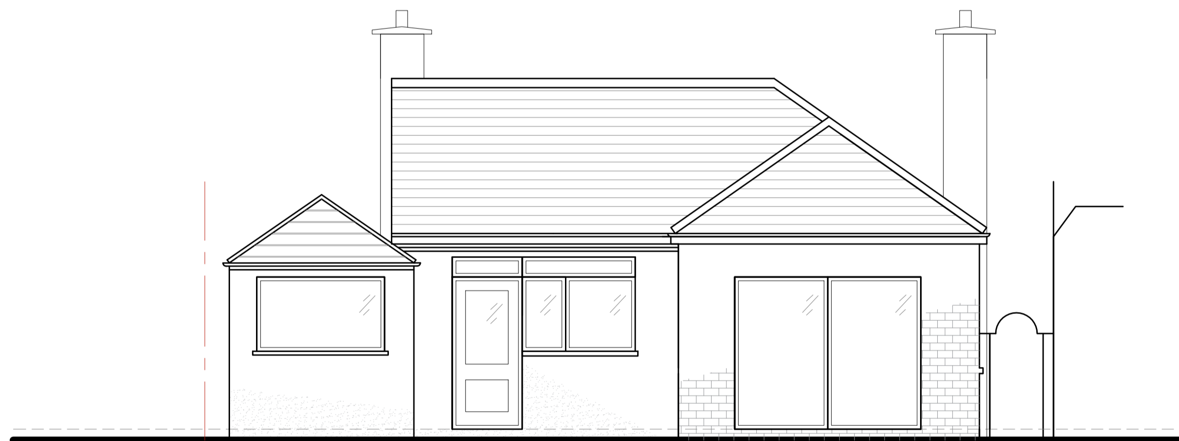
REAR ELEVATION SCALE: 1:50