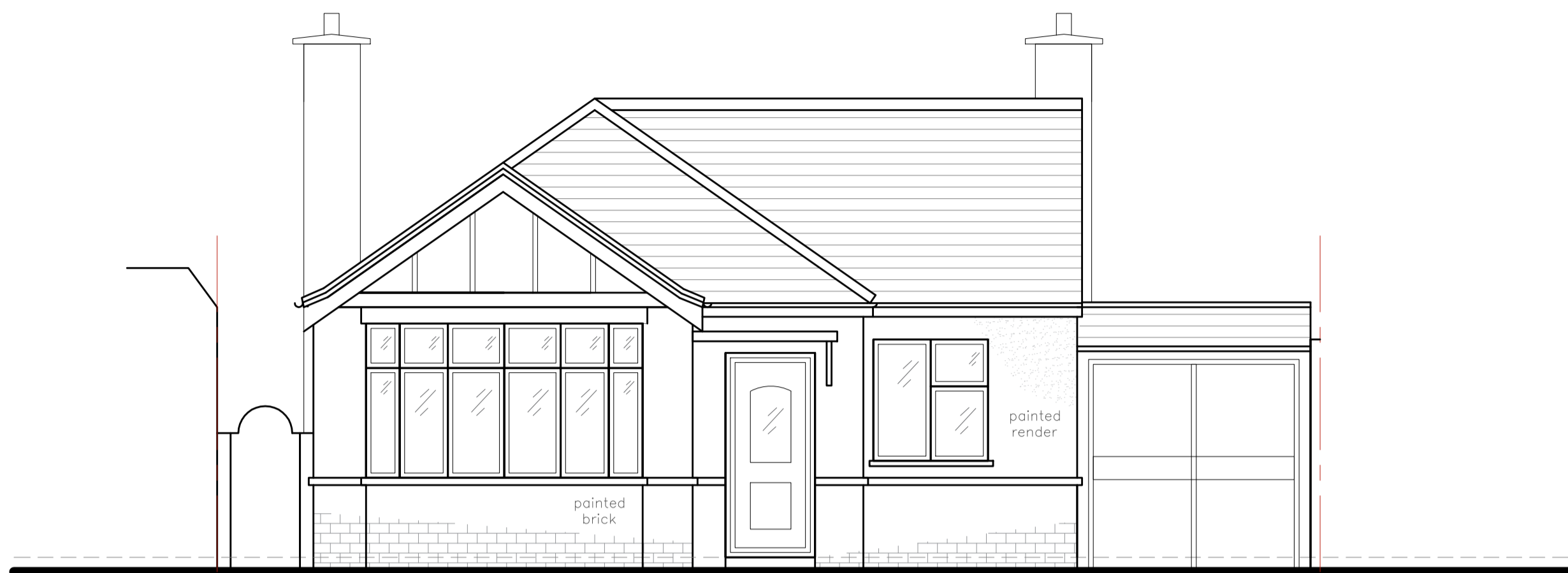
FRONT ELEVATION SCALE: 1:50

© This drawing is the property of Oxbridge Design and Detailing Services Ltd. Copyright is reserved by them and is issued on the condition that it is not copied or disclosed by or to any unauthorised persons without the prior consent in writing. All Dimensions to be checked on site any discrepancies must be reported to Oxbridge Design Detailing Services Ltd. prior to undertaking of any relevant works. Written dimensions to be followed in preference to scaled dimensions and all figured dimensions are millimetres unless otherwise stated.