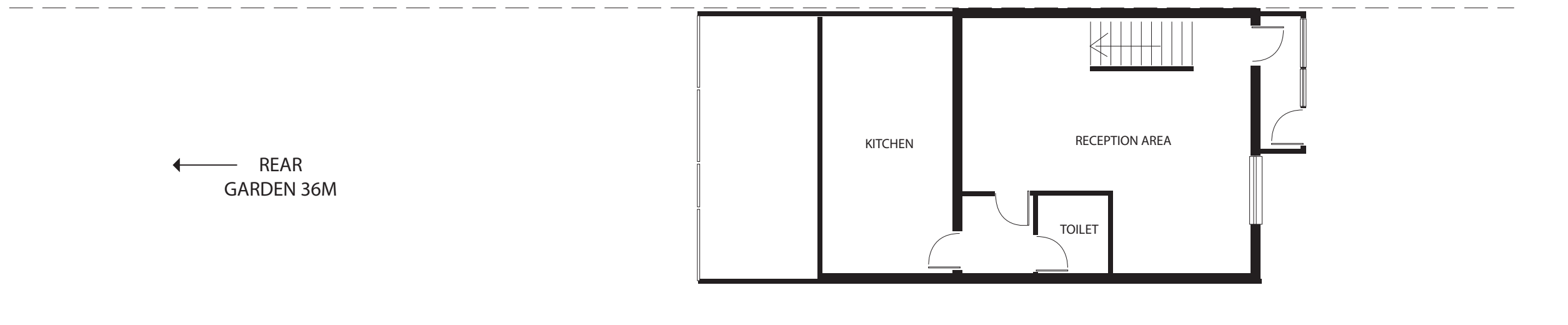
EXISTING GROUND FLOOR LAYOUT