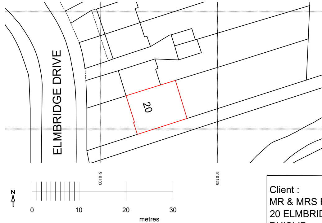
Block plan (1:500)

Client : MR & MRS PATTNI 20 ELMBRIDGE DRIVE RUISLIP HA4 7UT