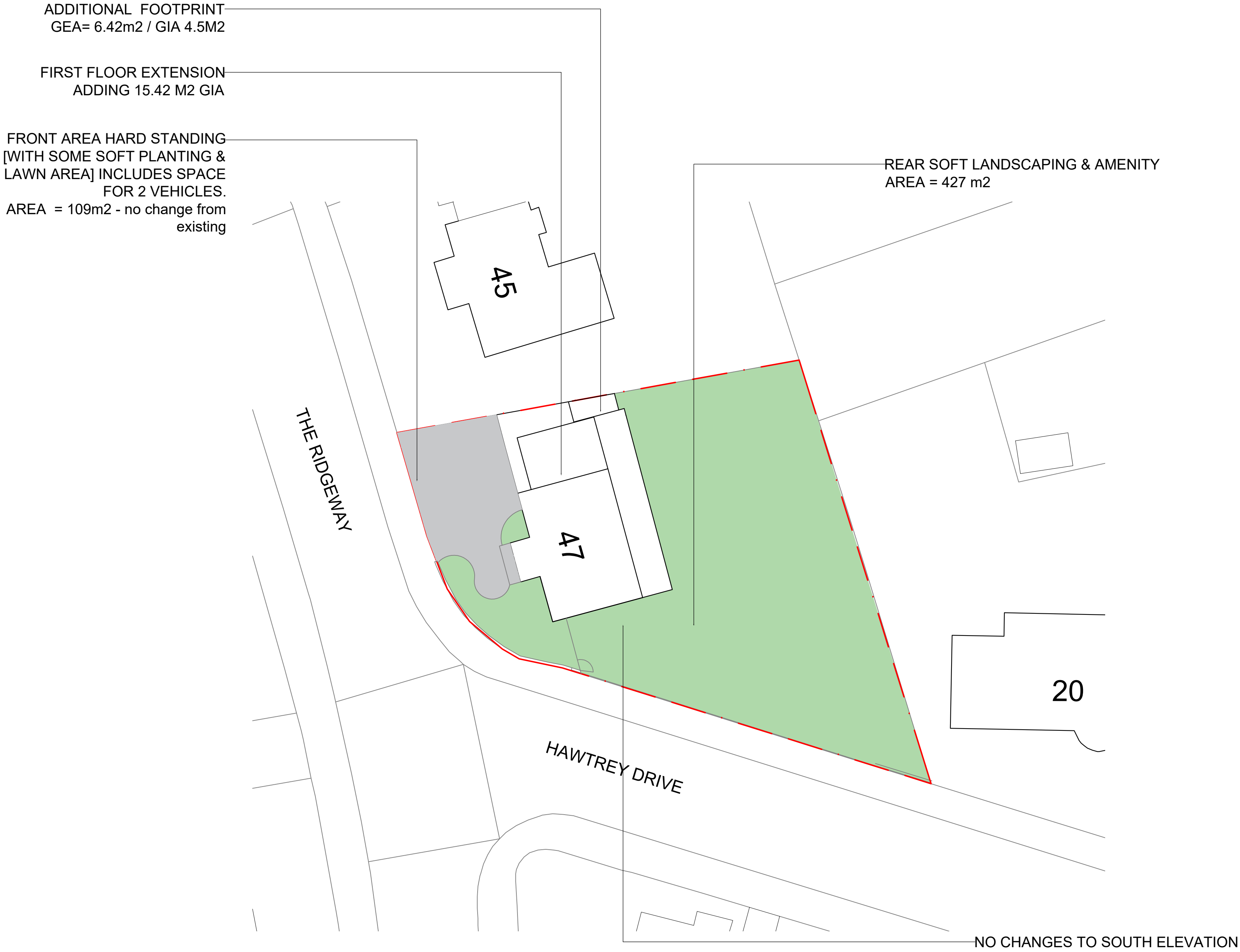
1 PROPOSED SITE BLOCK PLAN 1:200@A1 1:400@A3

SCALING FOR PLANNING PURPOSES ONLY. ALL DIMENSIONS AND LEVELS TO BE CHECKED ON SITE. WORK TO BE CARRIED OUT IN ACCORDANCE WITH BYE-LAWS AND REGULATIONS OF LOCAL AUTHORITIES AND STATUTORY UNDERTAKERS. THIS DRAWING MAY INCORPORATE INFORMATION FROM OTHER PROFESSIONALS. WE CANNOT ACCEPT RESPONSIBILITY FOR THE INTEGRITY AND ACCURACY OF SUCH INFORMATION. DRAWINGS, SPECIFICATIONS AND SCHEDULES ARE TO BE READ IN CONJUNCTION WITH ALL RELEVANT ARCHITECTS AND CONSULTANTS DRAWINGS AND SPECIFICATIONS. PRINT PDF OF THE DWG IN ACTUAL SIZE.