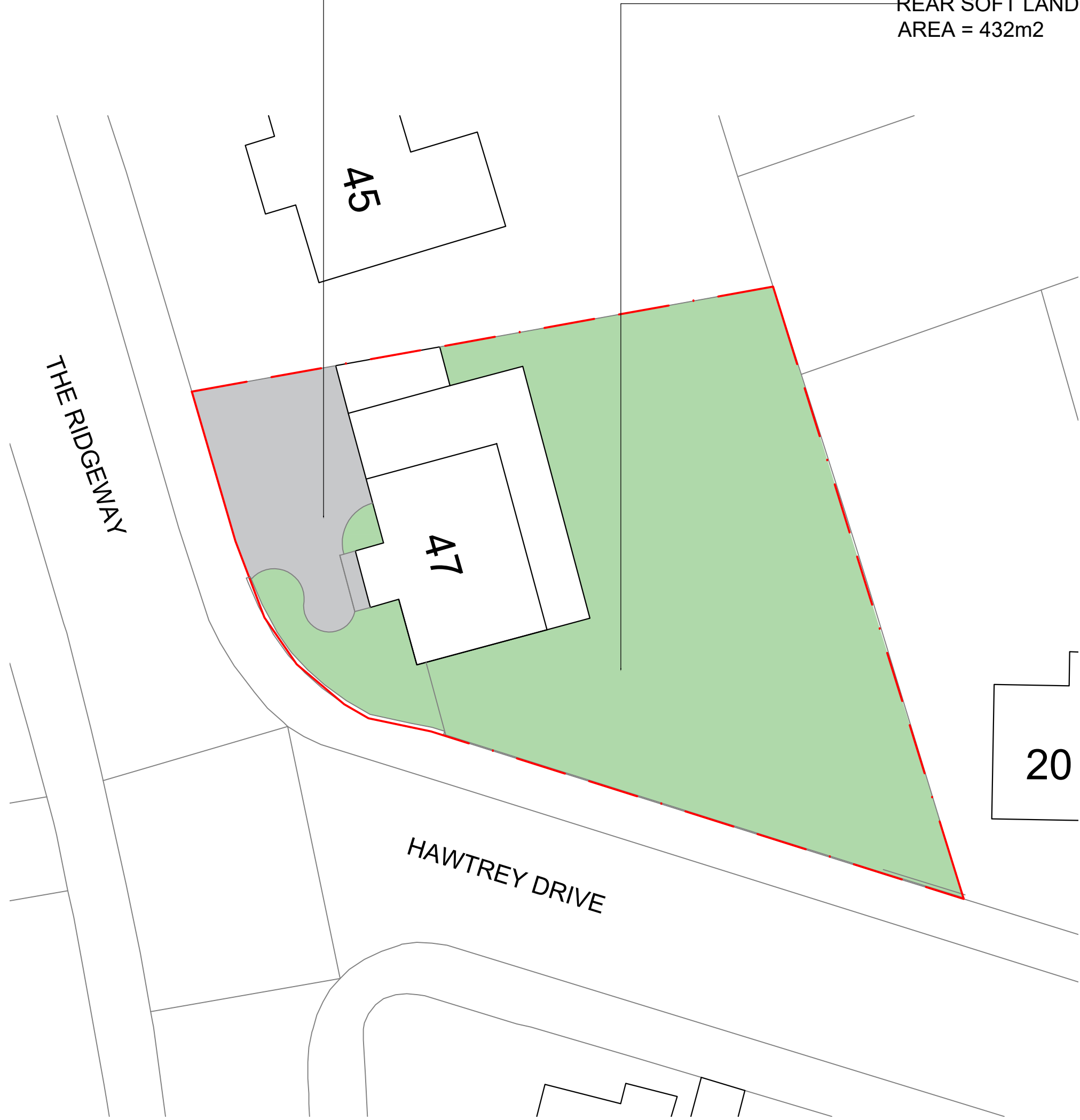
2 SITE BLOCK PLAN 1:200@A1 1:400@A3

REAR SOFT LANDSCAPING & AMENITY AREA = 432m2