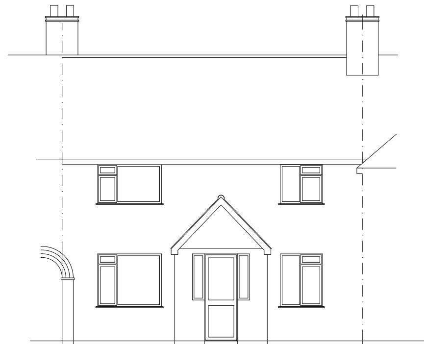
EXISTING FRONT ELEVATION (NO ALTERATIONS)