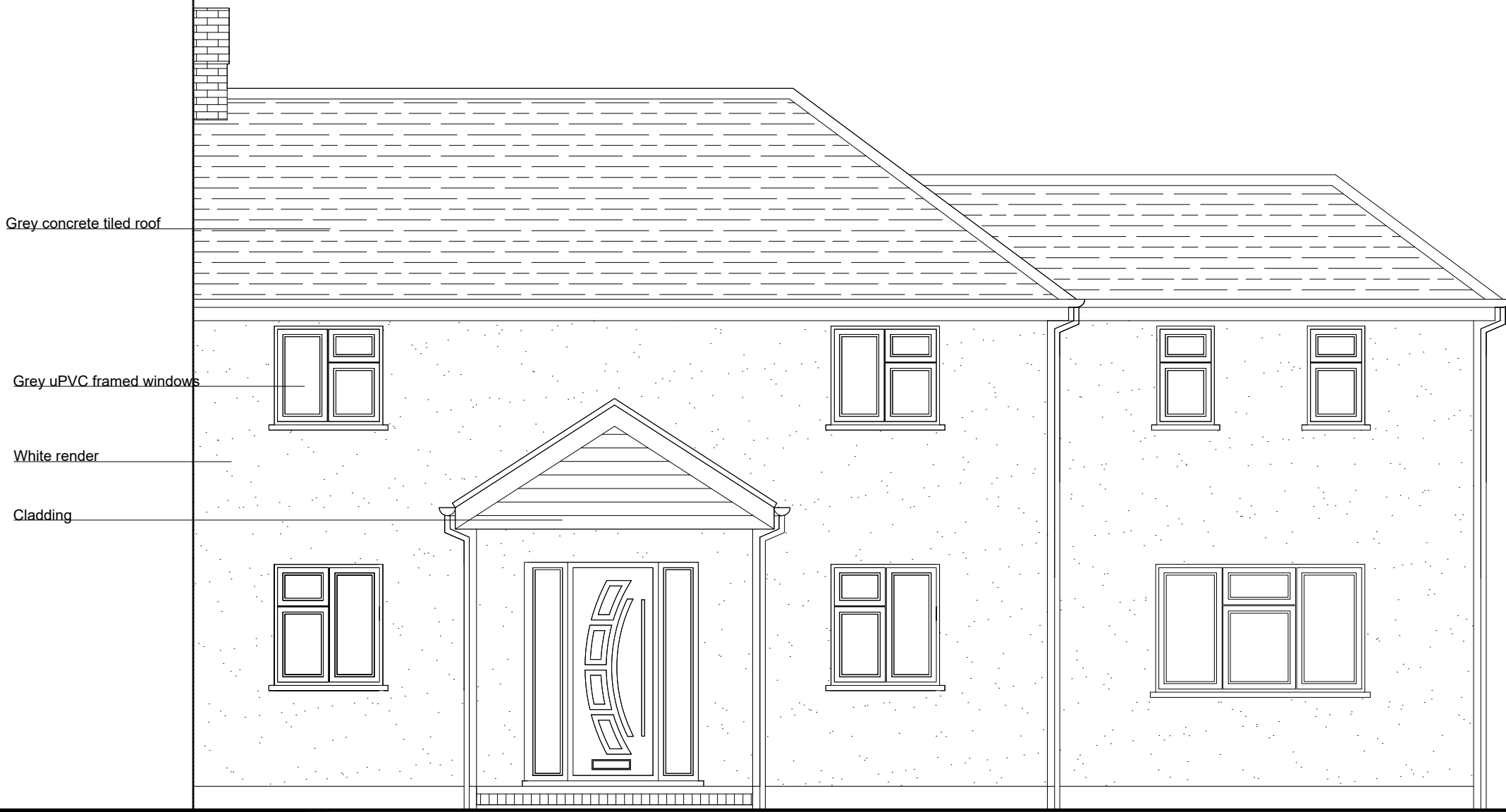
ELEVATION A PROPOSED FRONT ELEVATION