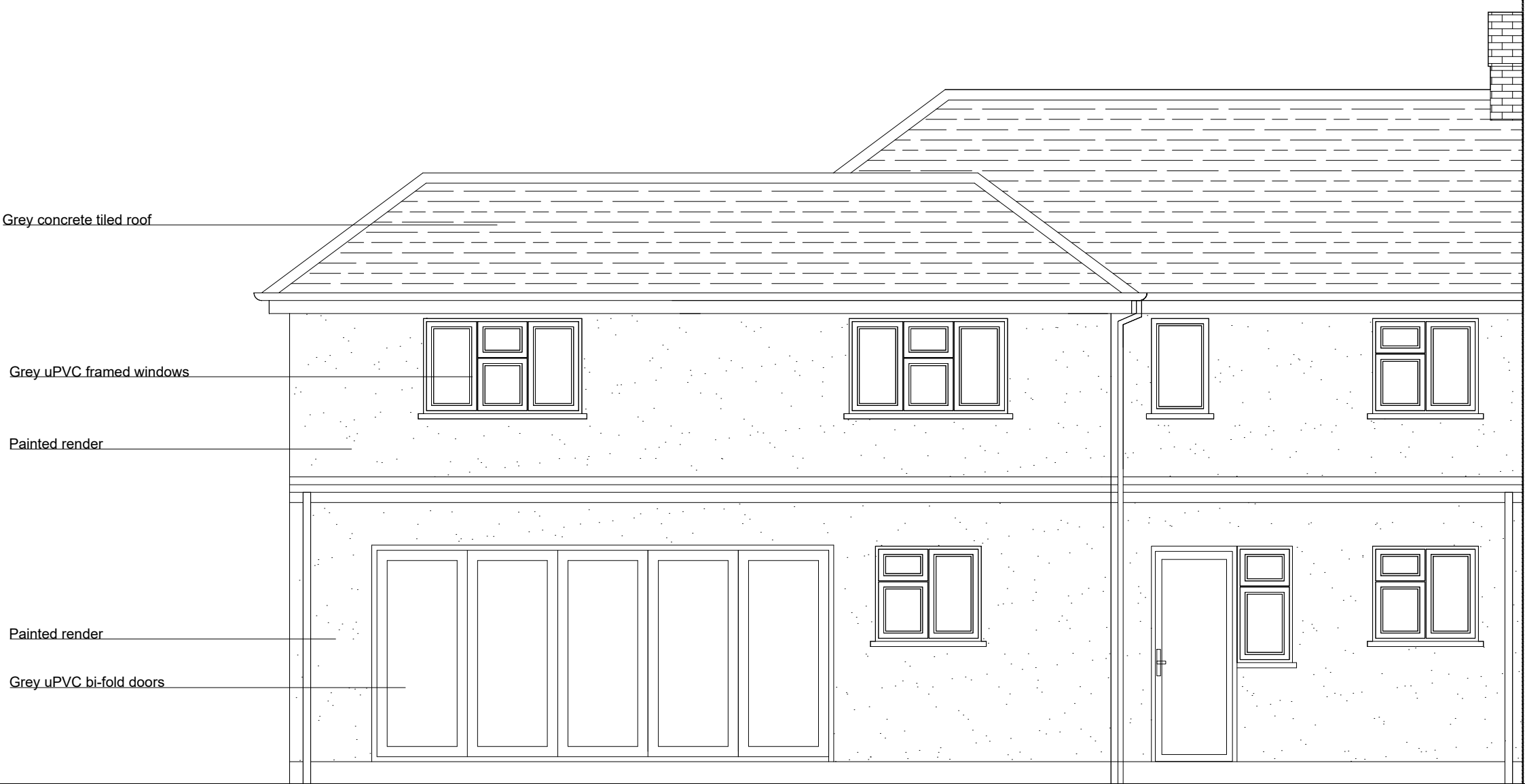
ELEVATION C PROPOSED REAR ELEVATION