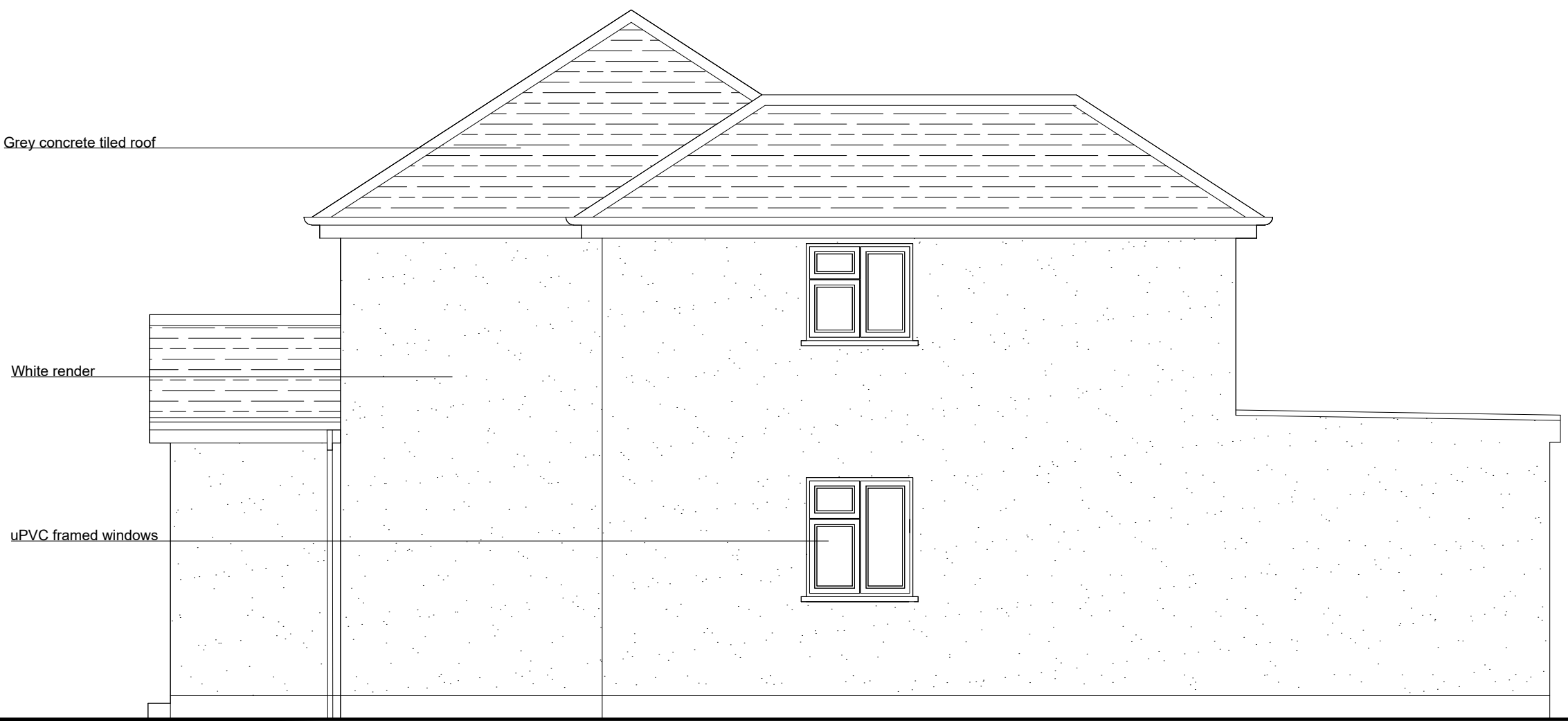
ELEVATION D PROPOSED SIDE ELEVATION