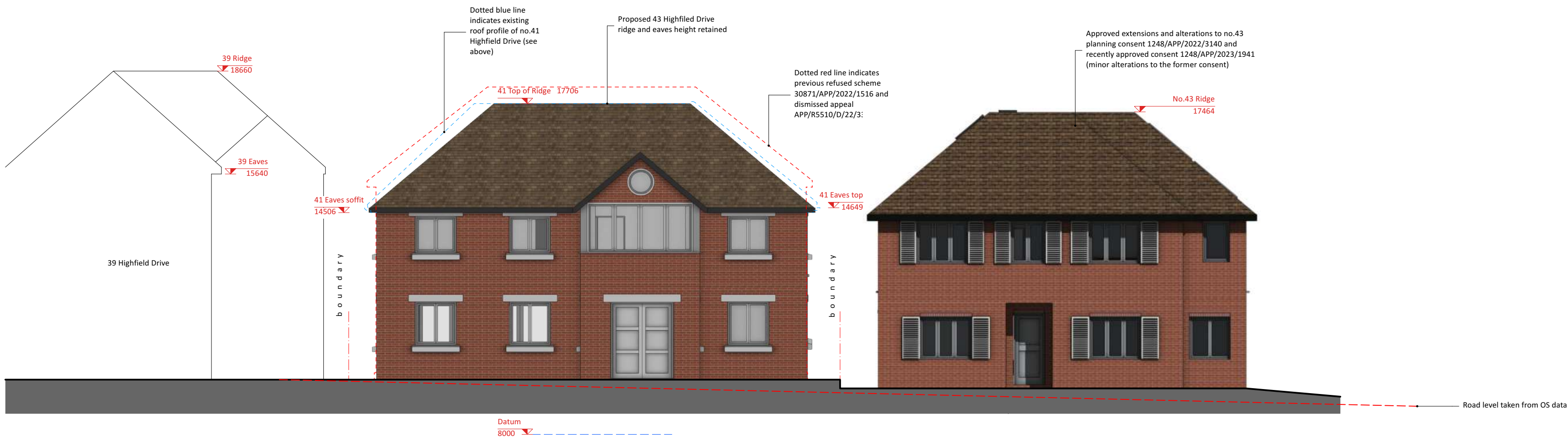
2 PROPOSED HIGHFIELD DRIVE ELEVATION