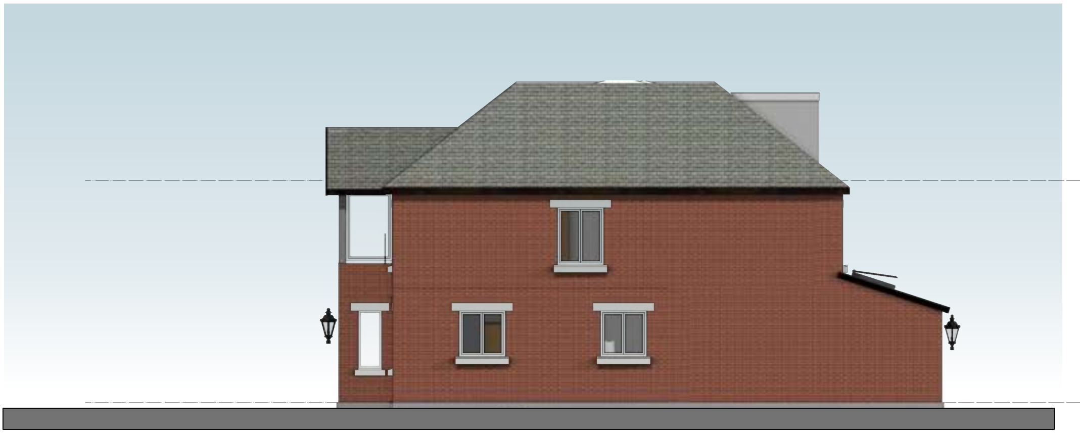
4 SOUTH Scale: 1:100