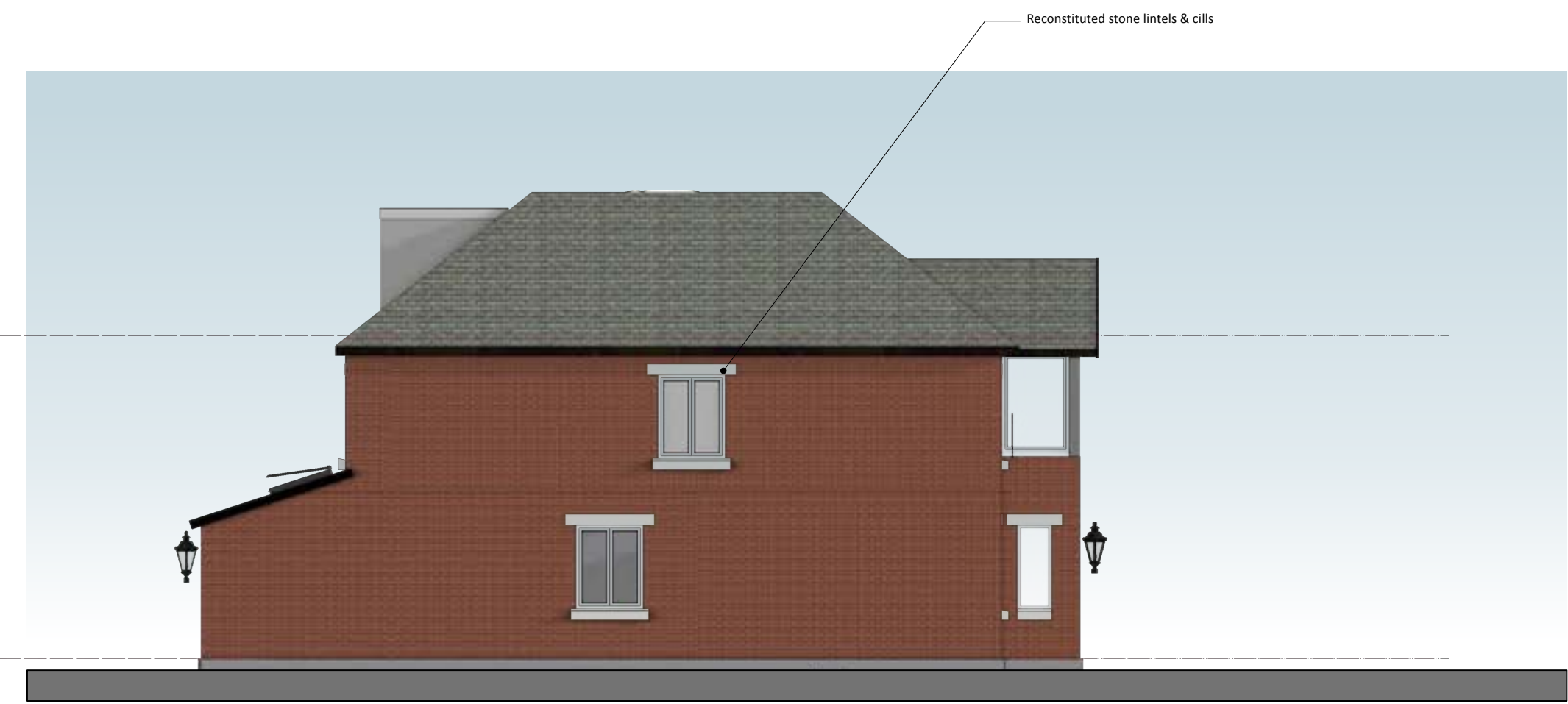
3 NORTH Scale: 1:100