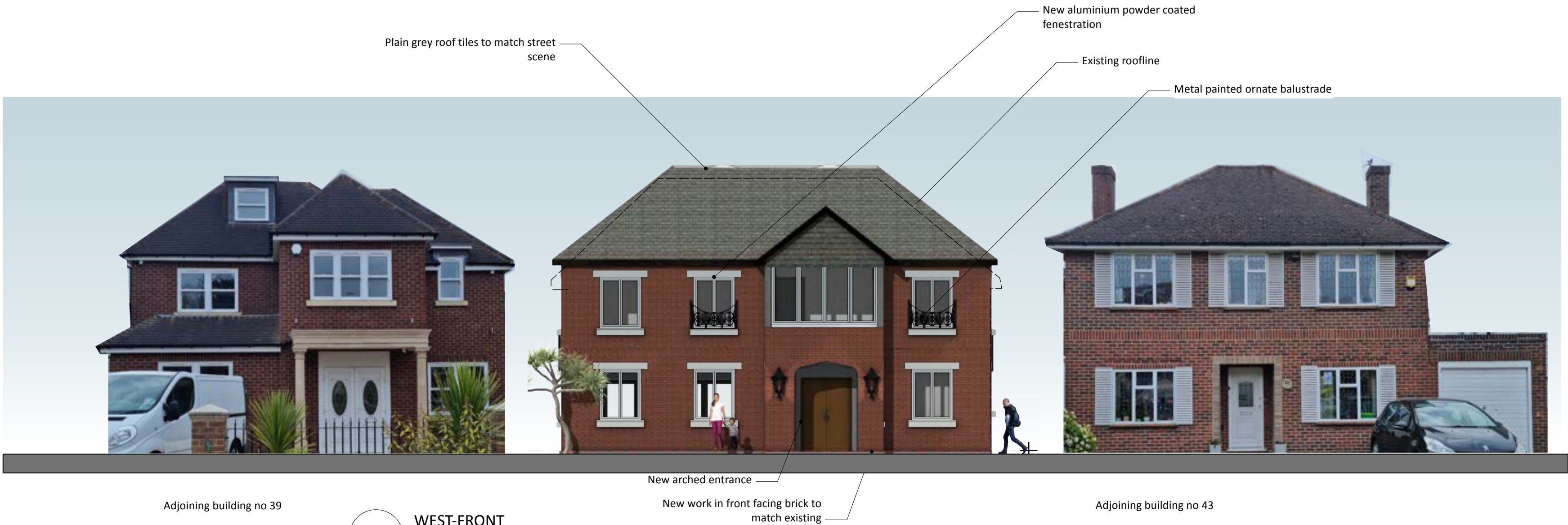
2 WEST-FRONT Scale: 1:100