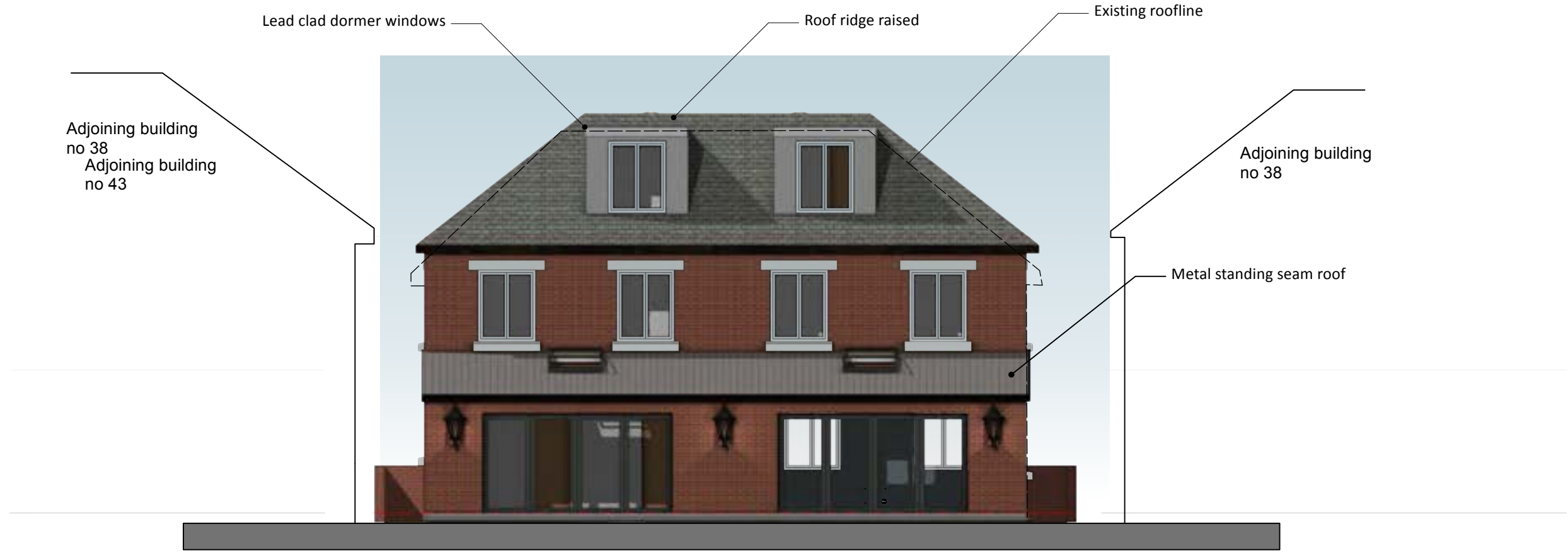
1 EAST-REAR Scale: 1:100