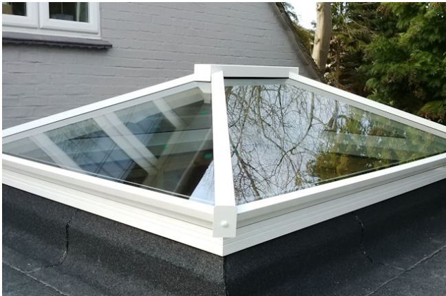
Pitched roof lantern