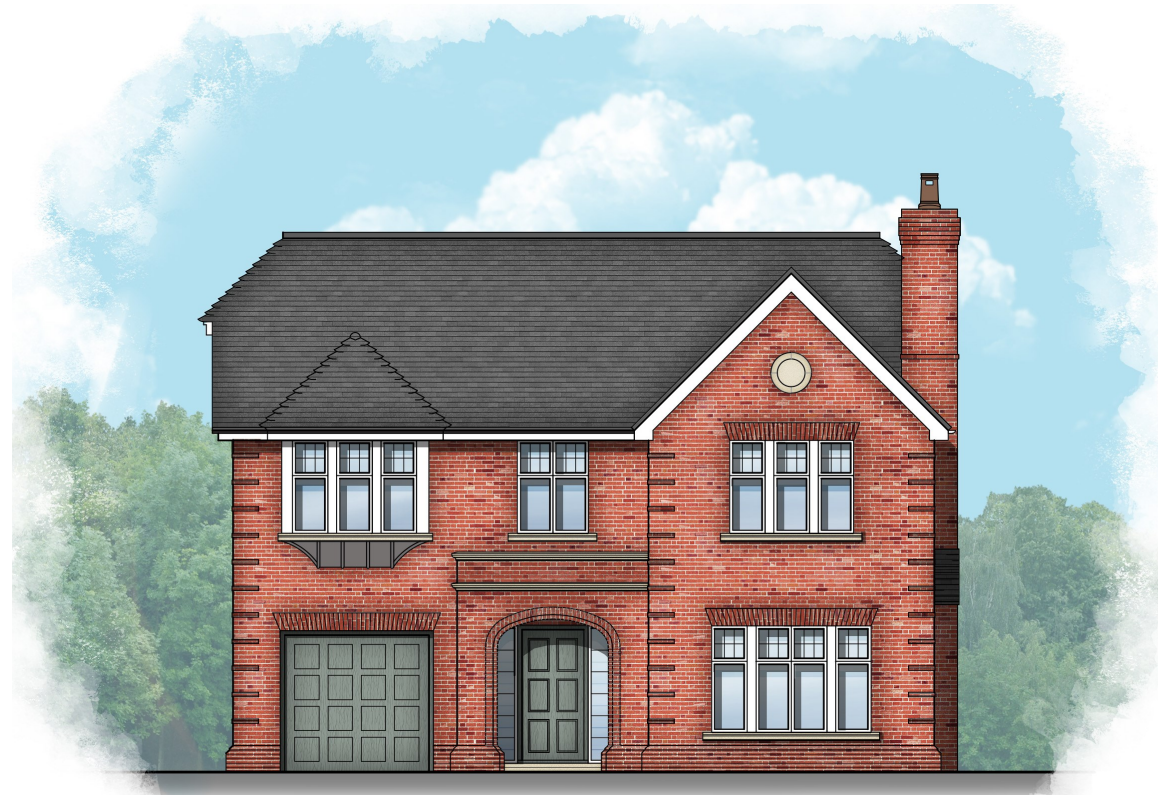
PLOT 1-2 FRONT ELEVATION