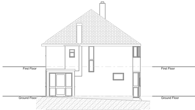
Existing Side Elevation 1:200