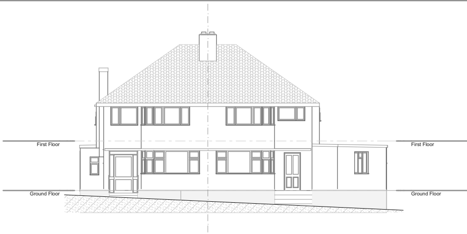
Existing Front Elevation 1:200