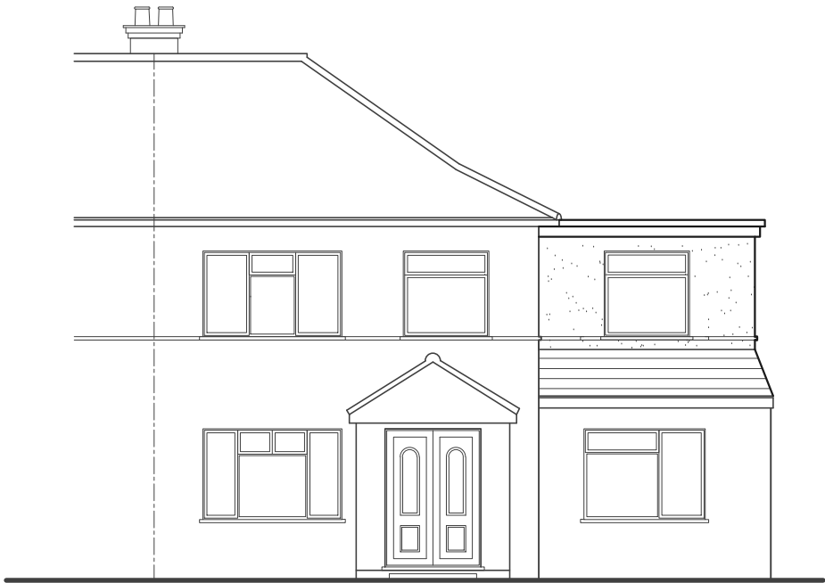
Front Elevation, Proposed