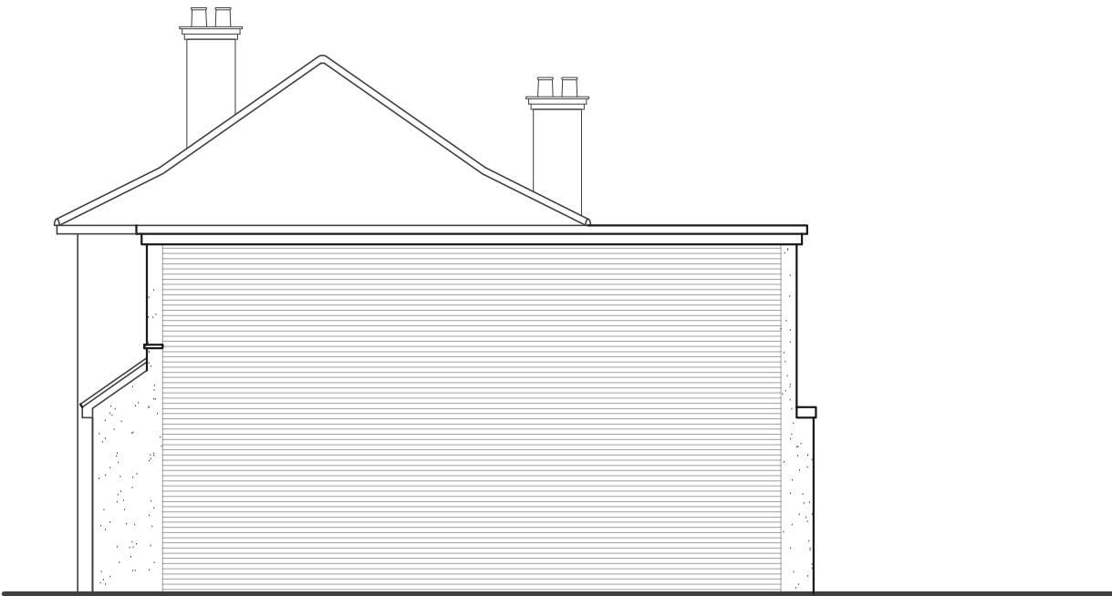
Side Elevation from 88, Proposed