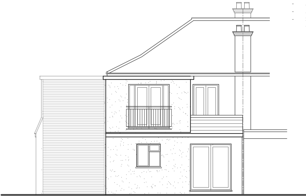
Rear Elevation, Proposed