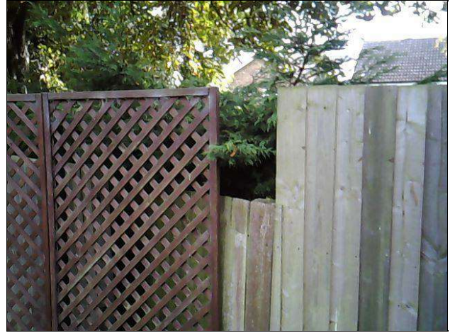
H1 - Cypress