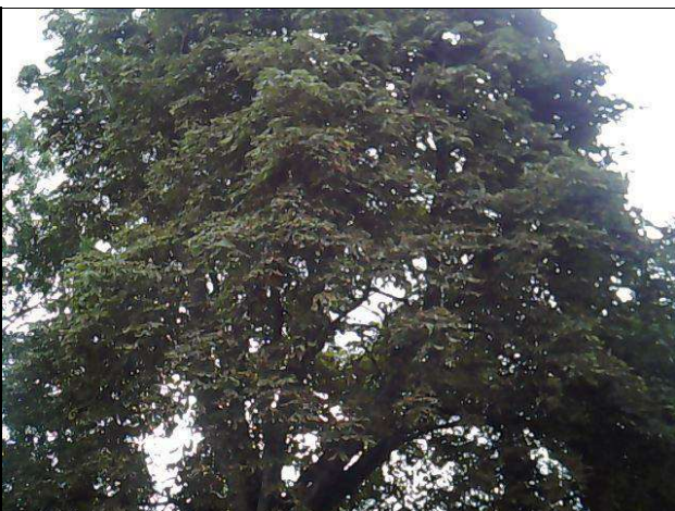
T1 - Horse Chestnut