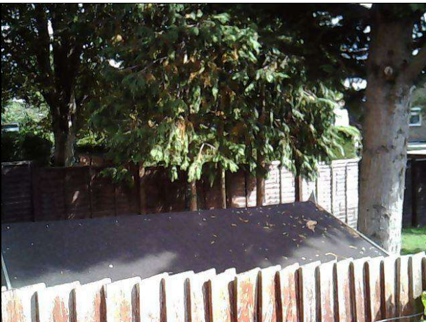
H2 - Cypress (Lawson)