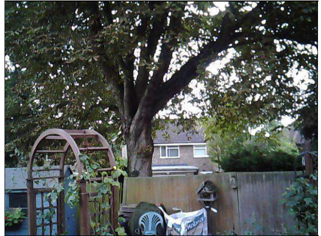
T1 - Horse Chestnut