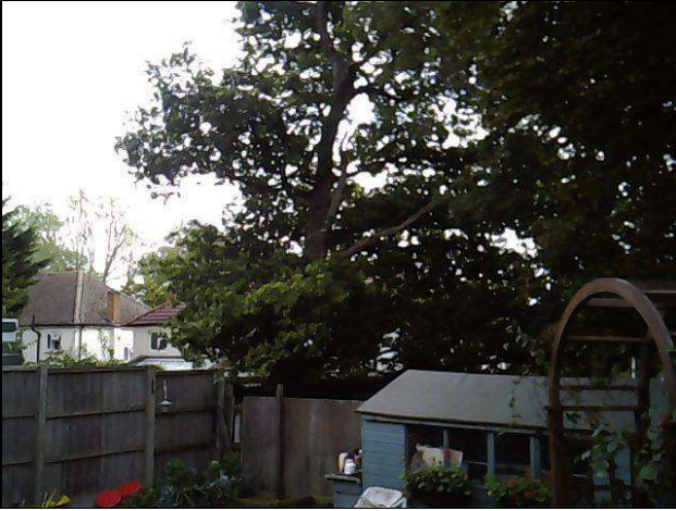
T3 - Oak