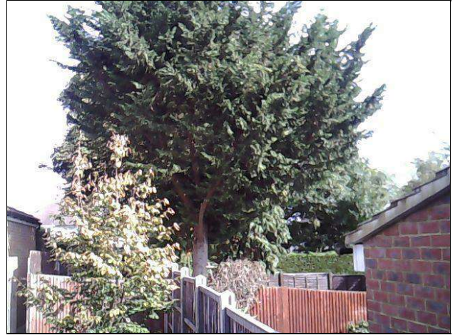
T4 - Cypress (Leyland)