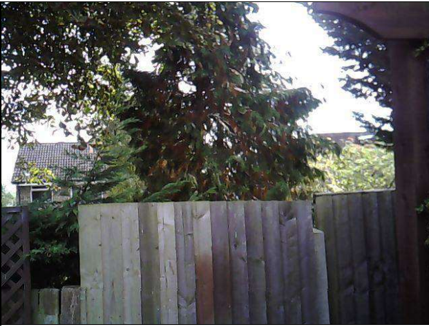
H2 - Cypress (Lawson)