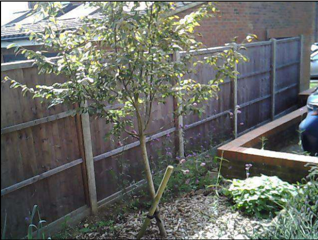
T5 - Prunus