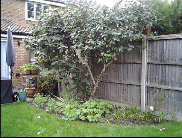
SG1 - Mixed species shrubs