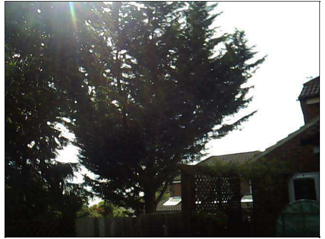
T4 - Cypress (Leyland)