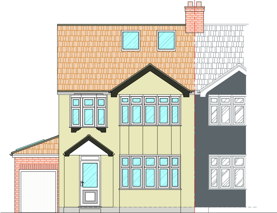
FRONT ELEVATION scale 1:100