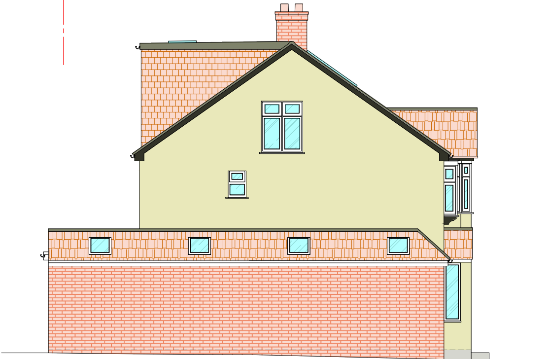
SIDE ELEVATION scale 1:100

This drawing is not for CONSTRUCTION purposes. If no dimension is given, we take no responsibility for any dimension obtained by measuring or scaling from this drawing. This drawing is the property of Maplin Studio Limited. It is copyright protected and is not to be reproduced, disclosed or copied without written permission.