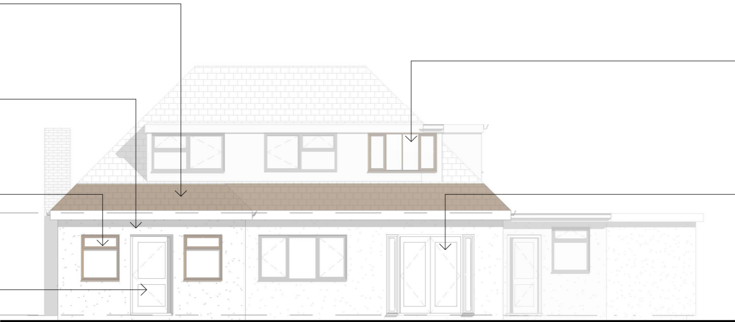
PROPOSED NORTH ELEVATION 1 : 100

Remove existing window together with lintel above opening. Widen and adapt structural opening to suit new external full height leval access glazed french doors and side screens. Finish TBC by client.