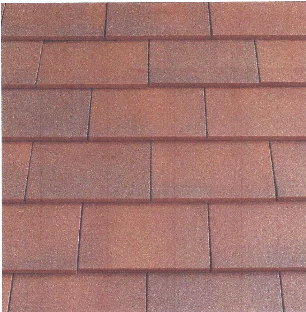
MARLEY ACME SINGLE CAMBER MIXED BRINDLE CLAY PLAIN ROOF TILING.