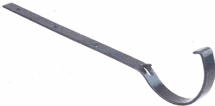
BLACK FINISHED STEEL HALF ROUND TOP FIX RAFTER GUTTER BRACKET.