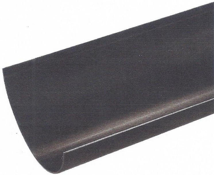
BLACK PVC-U HALF ROUND RAINWATER GUTTERING.