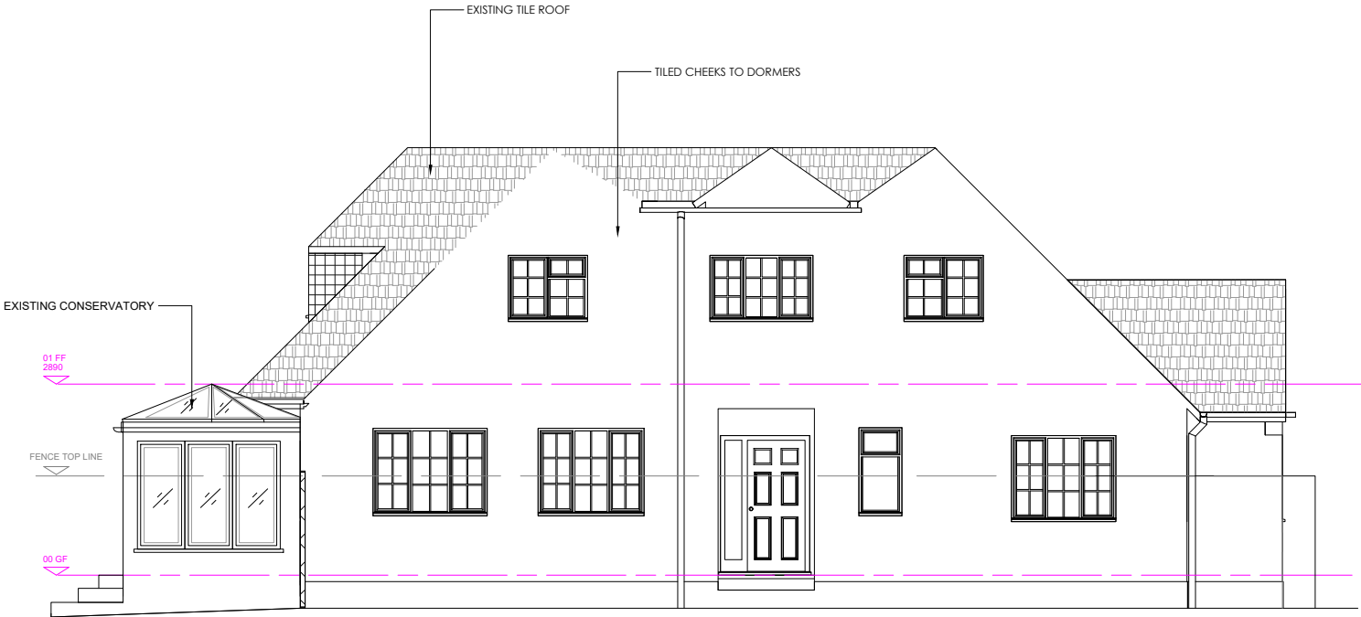
Existing Side Elevation Scale 1:100 @ A3