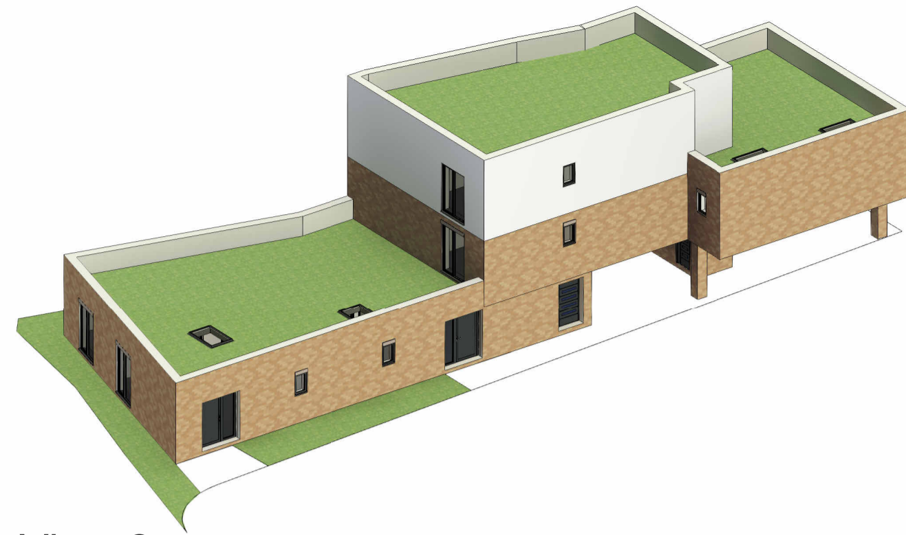
2 View 2