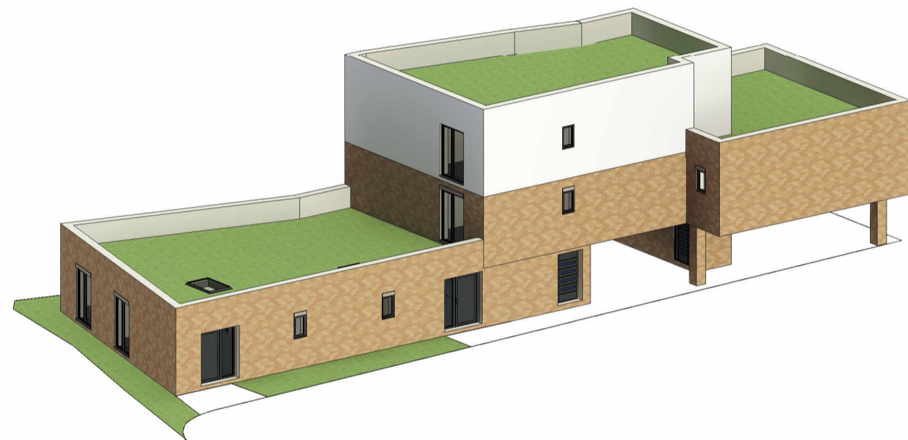
3 View 3