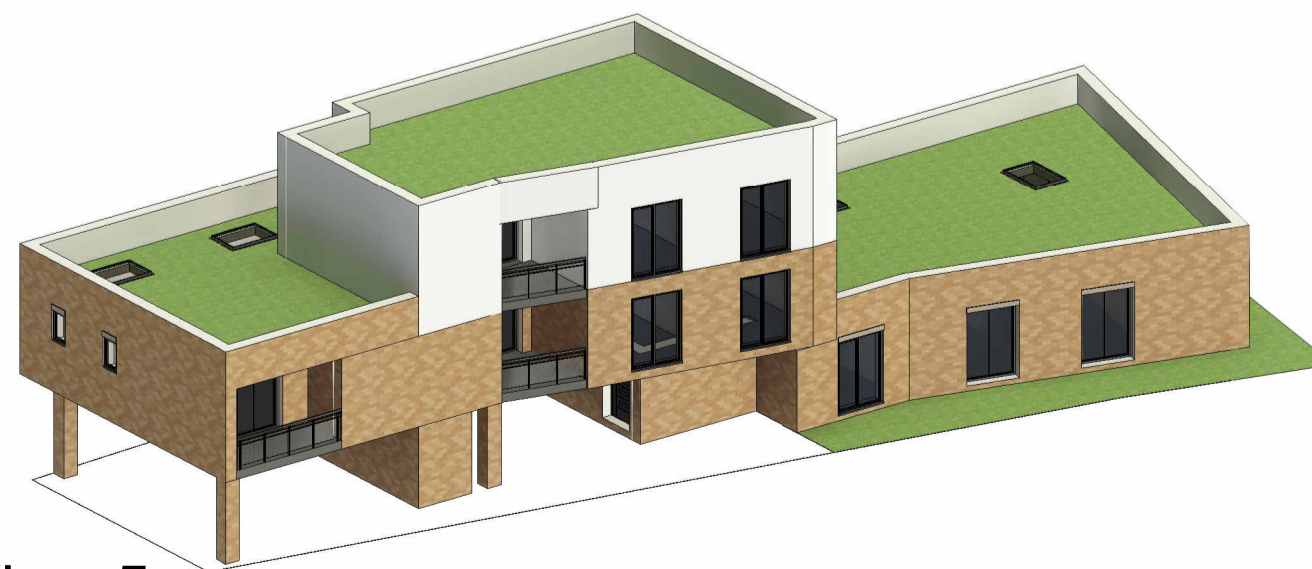
5 View 5