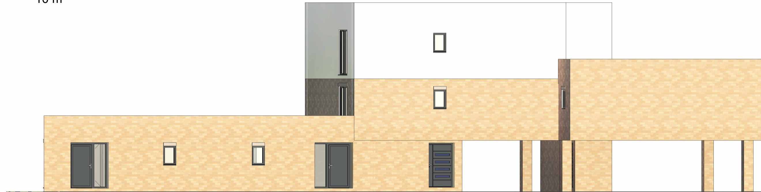
1 East 1 : 100