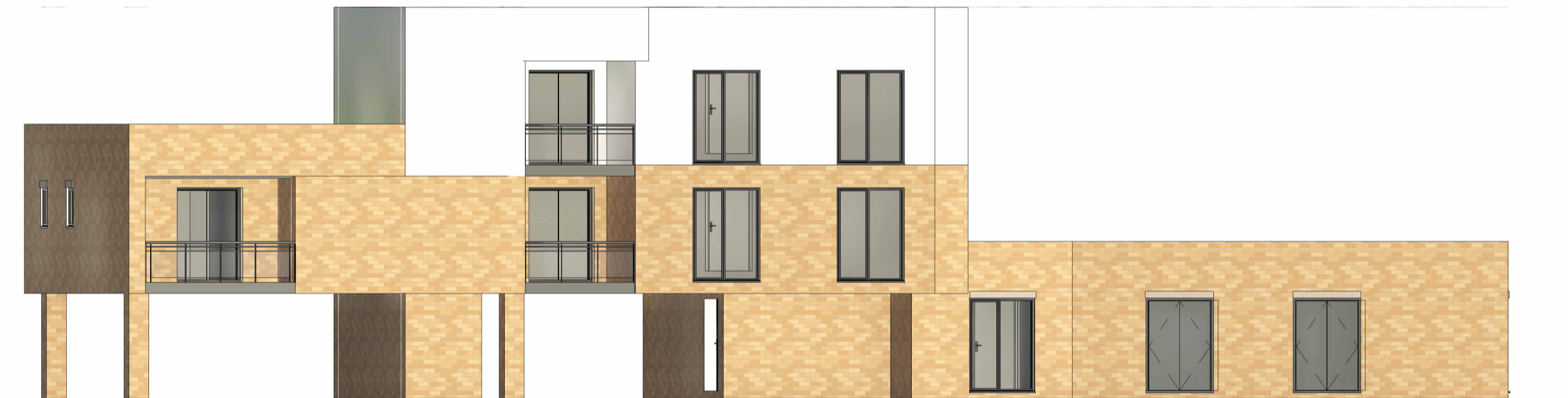
2 West 1 : 100