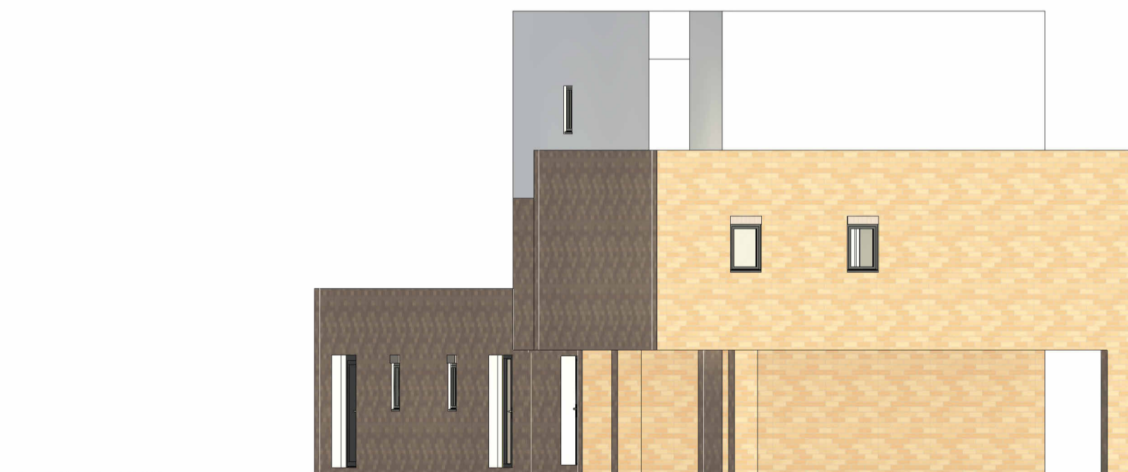
4 North 1 : 100