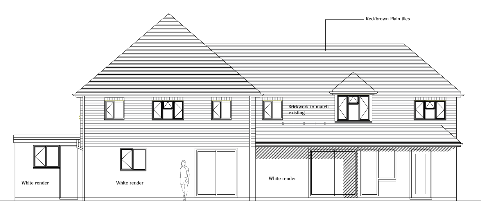
Previously Proposed Rear Elevation