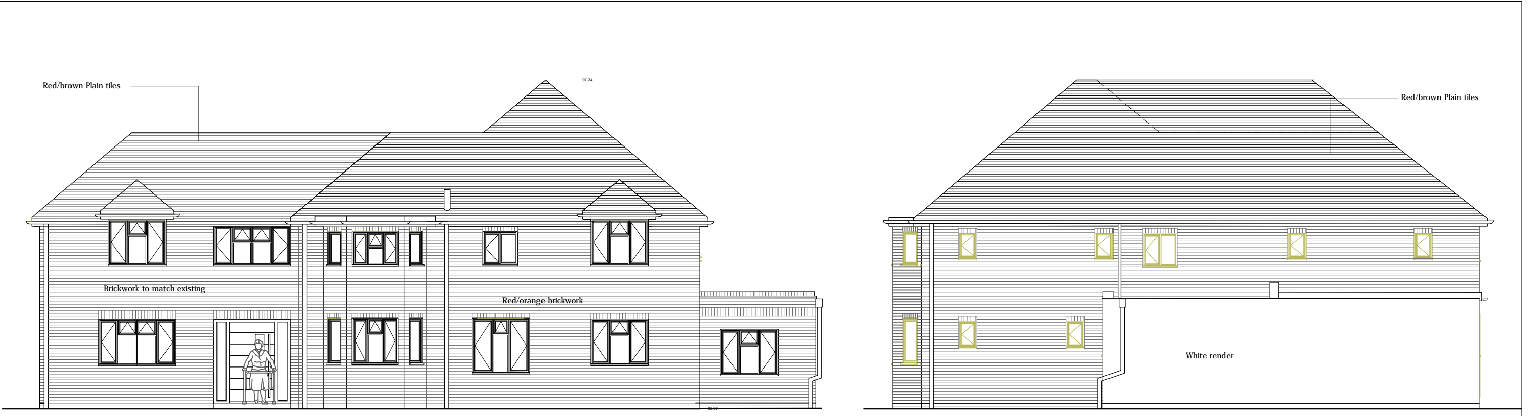
Previously Proposed Front Elevation