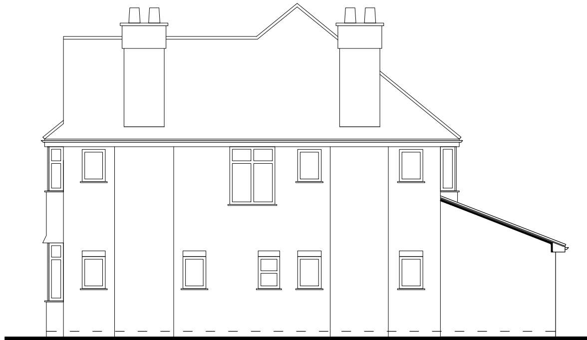
EXISTING SIDE ELEVATION : NORTH