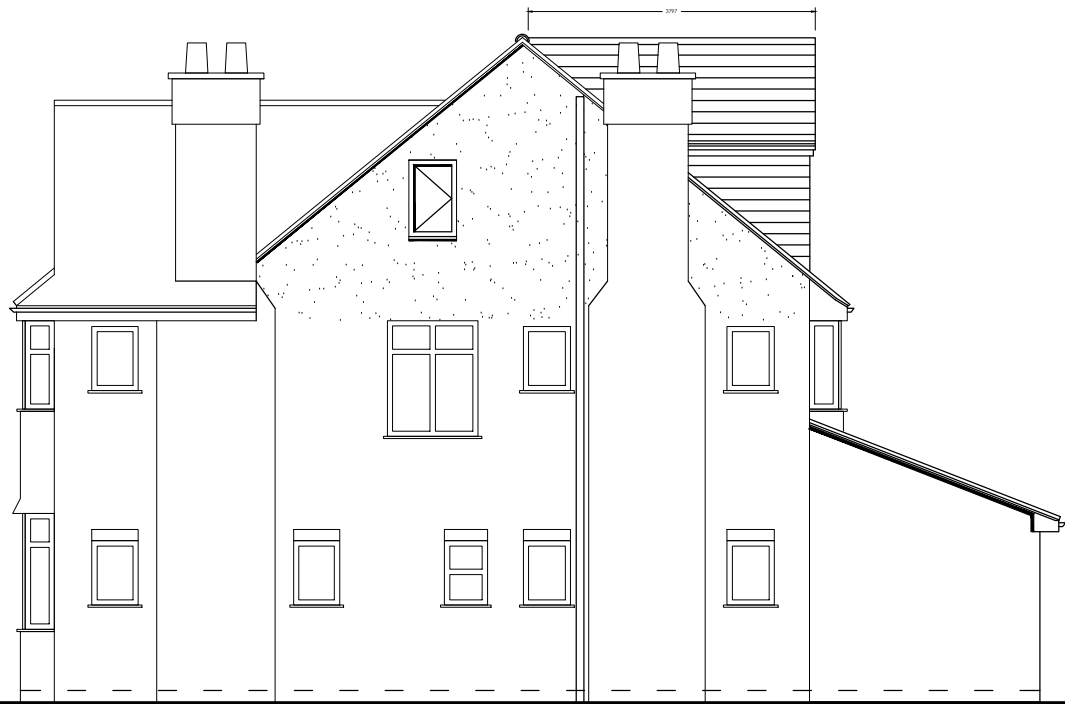
PROPOSED SIDE ELEVATION : NORTH