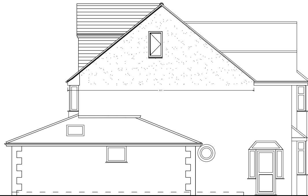
PROPOSED SIDE ELEVATION : SOUTH