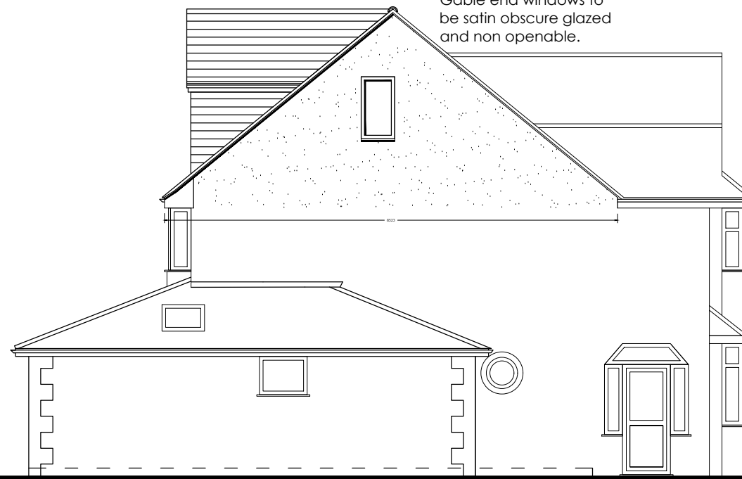
PROPOSED SIDE ELEVATION : SOUTH

Gable end windows to be satin obscure glazed and non openable.