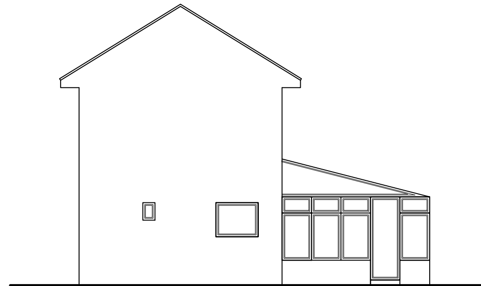
EXISTING OTHER SIDE ELEVATION

MATCHING MATERIALS TO BE USED FOR REAR EXTENSION