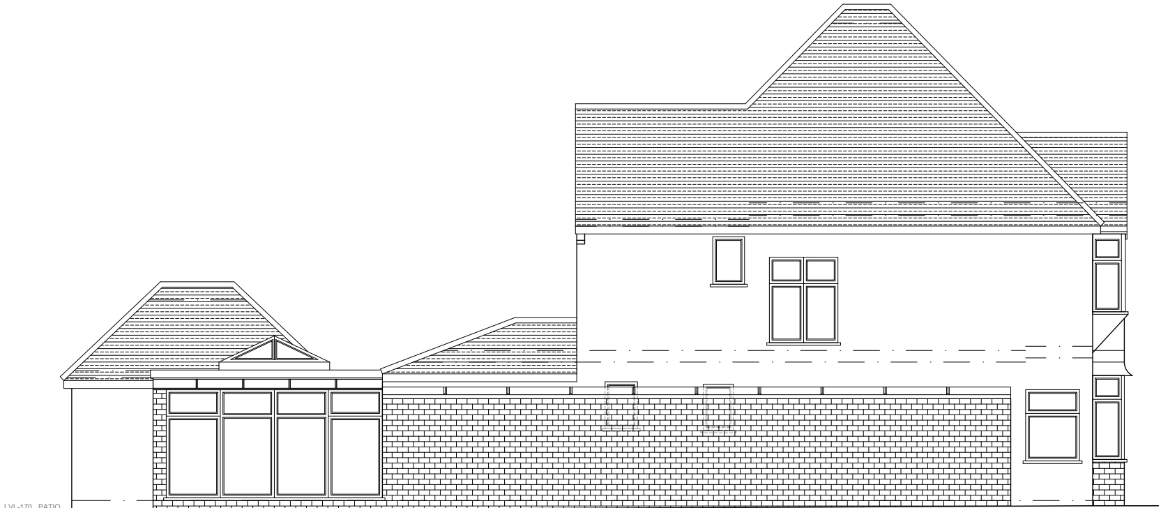
PROPOSED SIDE ELEVATIONS (VIEW FROM NO. 271) SCALE 1:100