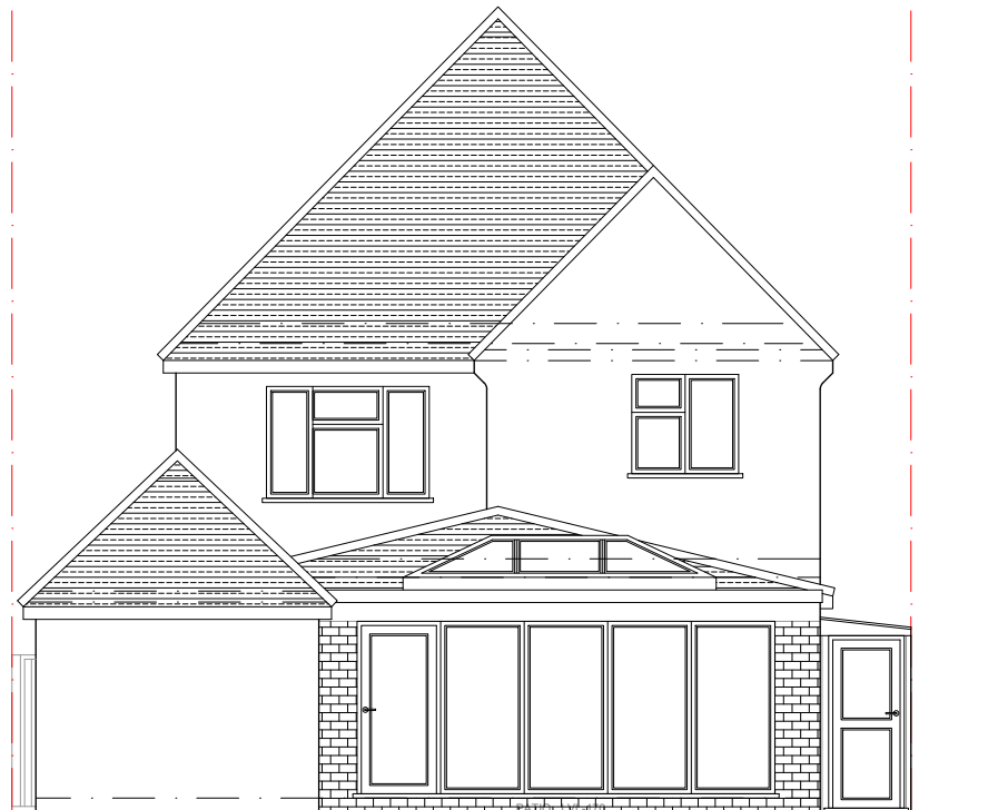
PROPOSED REAR ELEVATIONS SCALE 1:100