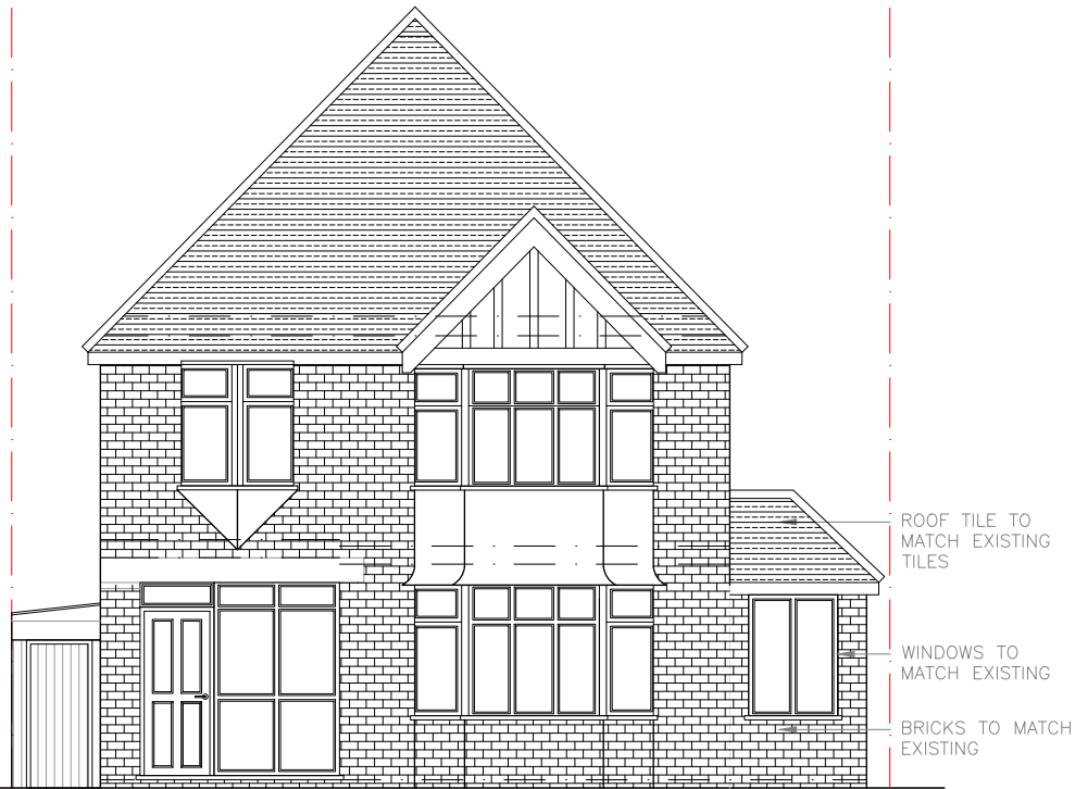
PROPOSED FRONT ELEVATIONS SCALE 1:100