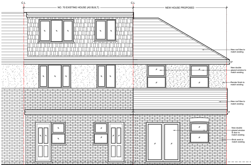
03 - REAR ELEVATION