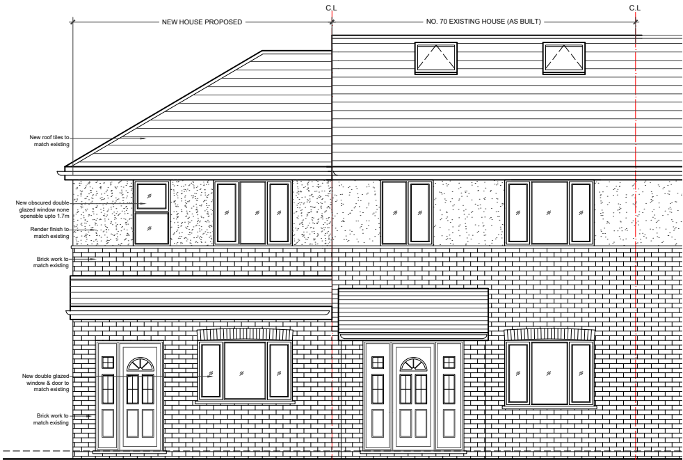
01 - FRONT ELEVATION