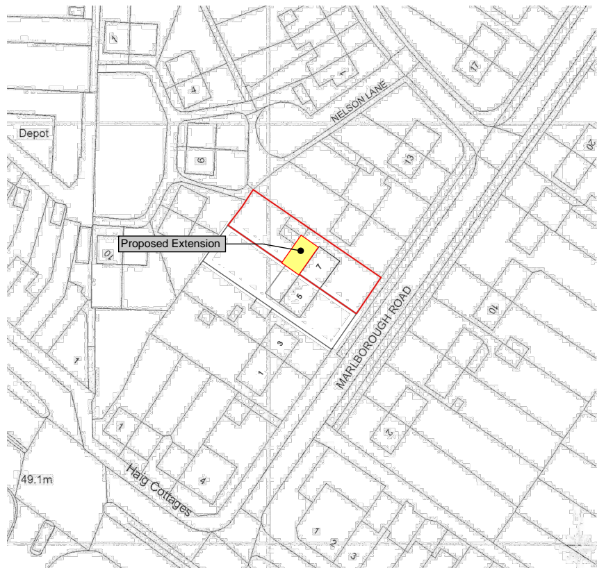
PROPOSED LOCATION PLAN SCALE 1:1250