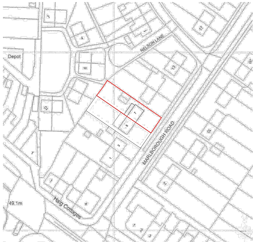
EXISTING LOCATION PLAN SCALE 1:1250