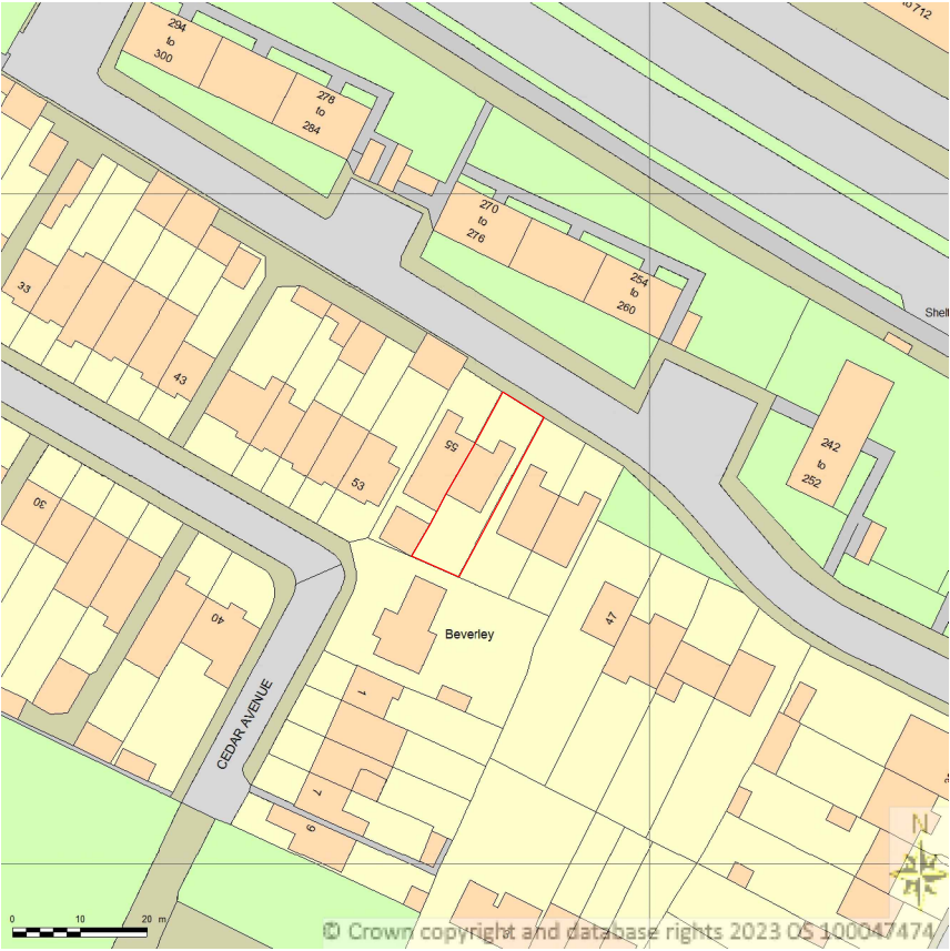
Location Plan @ 1:1250