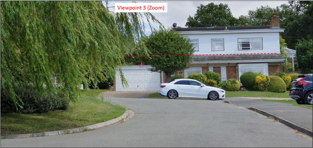
Viewpoint 3 (Zoom)