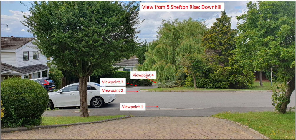
View from 5 Shefton Rise: Downhill