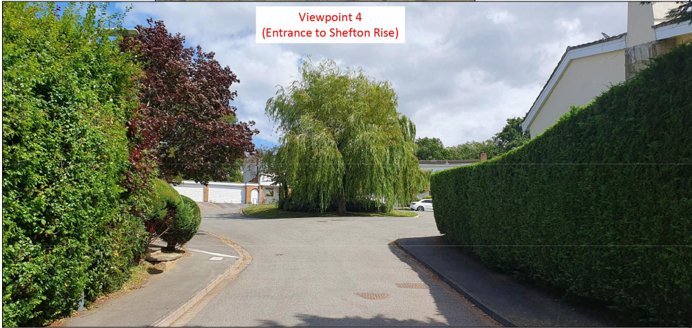
Viewpoint 4 (Entrance to Shefton Rise)