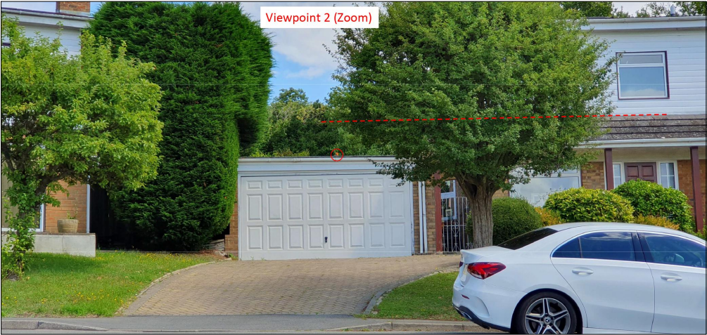
Viewpoint 2 (Zoom)