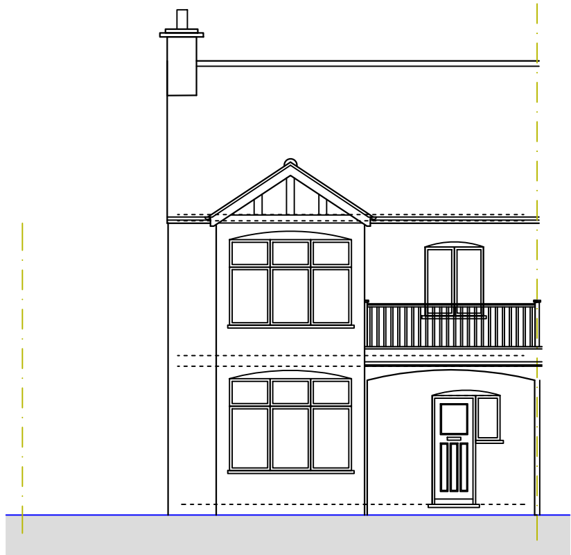
○ Front Elevation 1 : 1 0 0