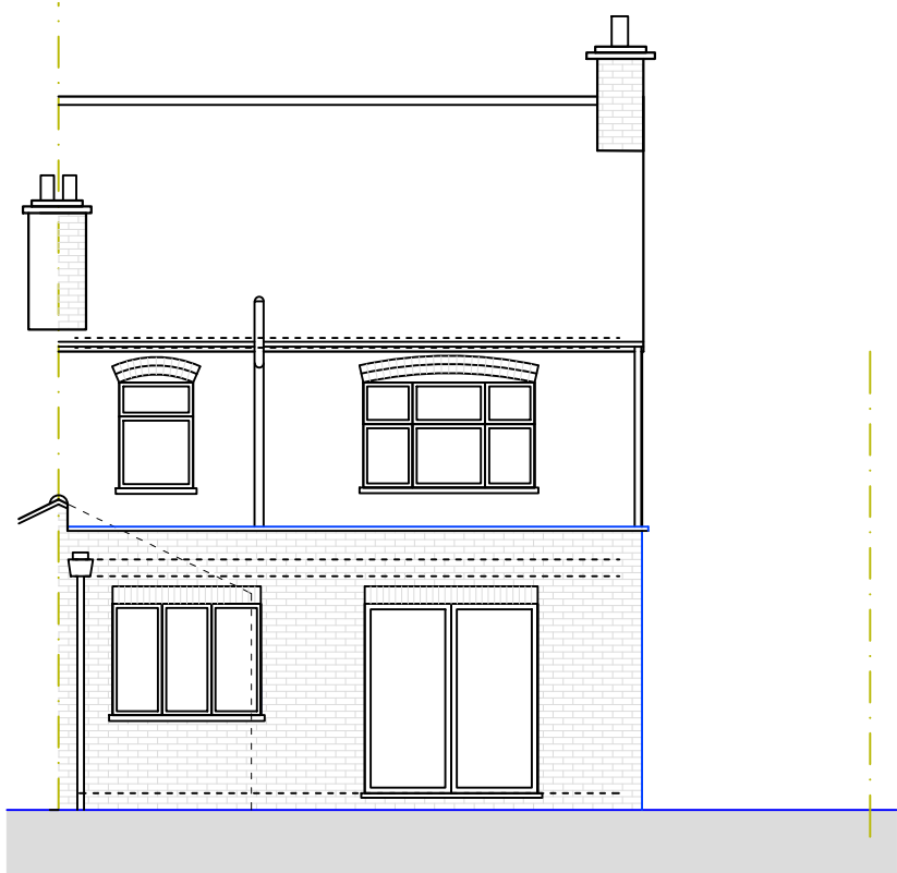
○ Rear Elevation 1 : 1 0 0