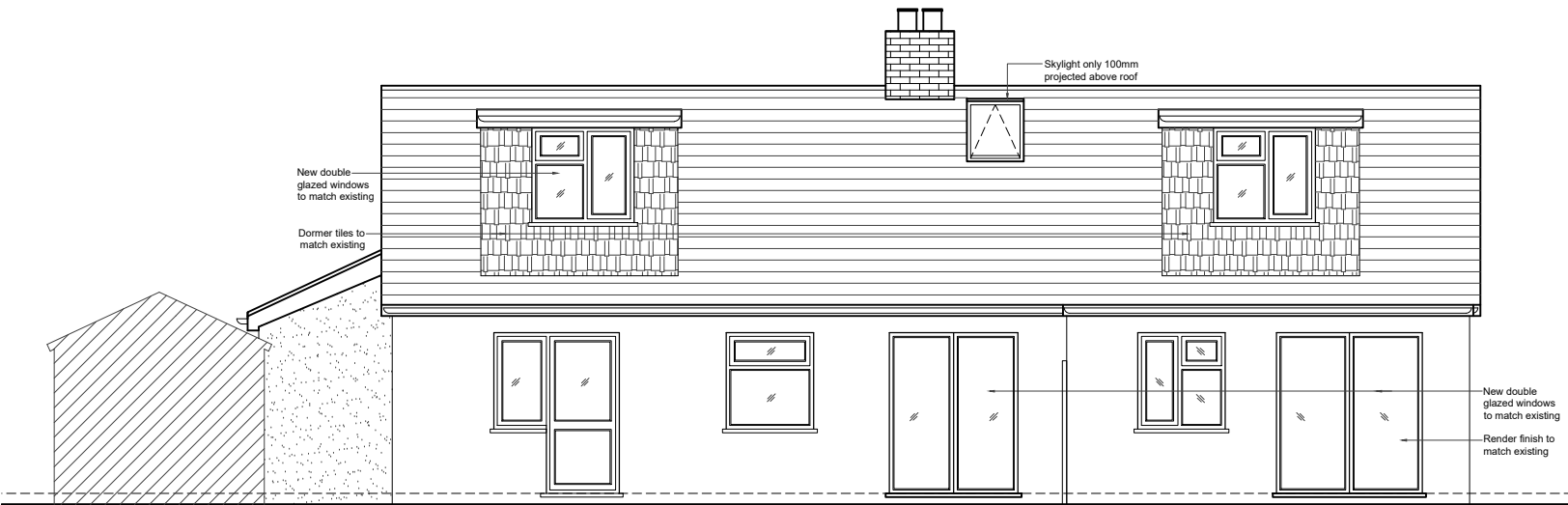
03 - REAR ELEVATION