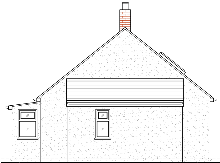
03 - RIGHT SIDE ELEVATION