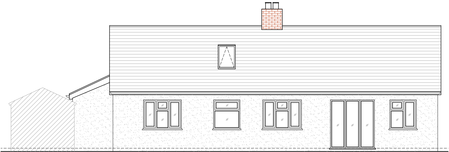
04 - REAR ELEVATION