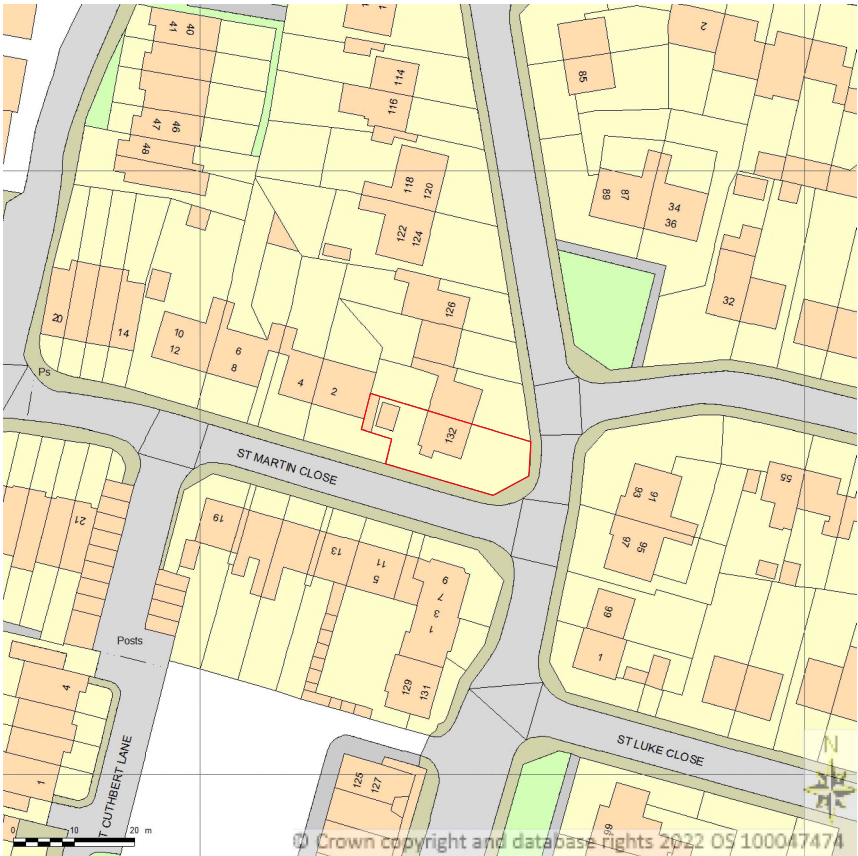
Location Plan @ 1:1250

Proposed Development: Ground Floor Side Extension