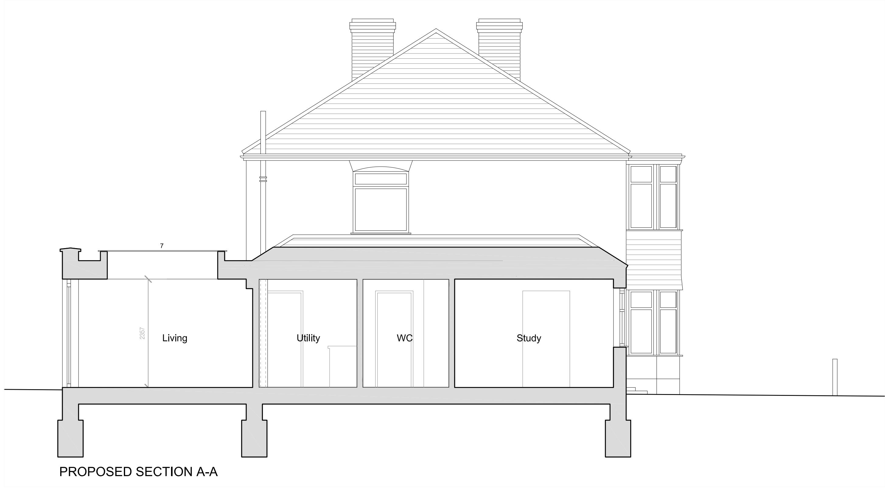
PROPOSED SECTION A-A