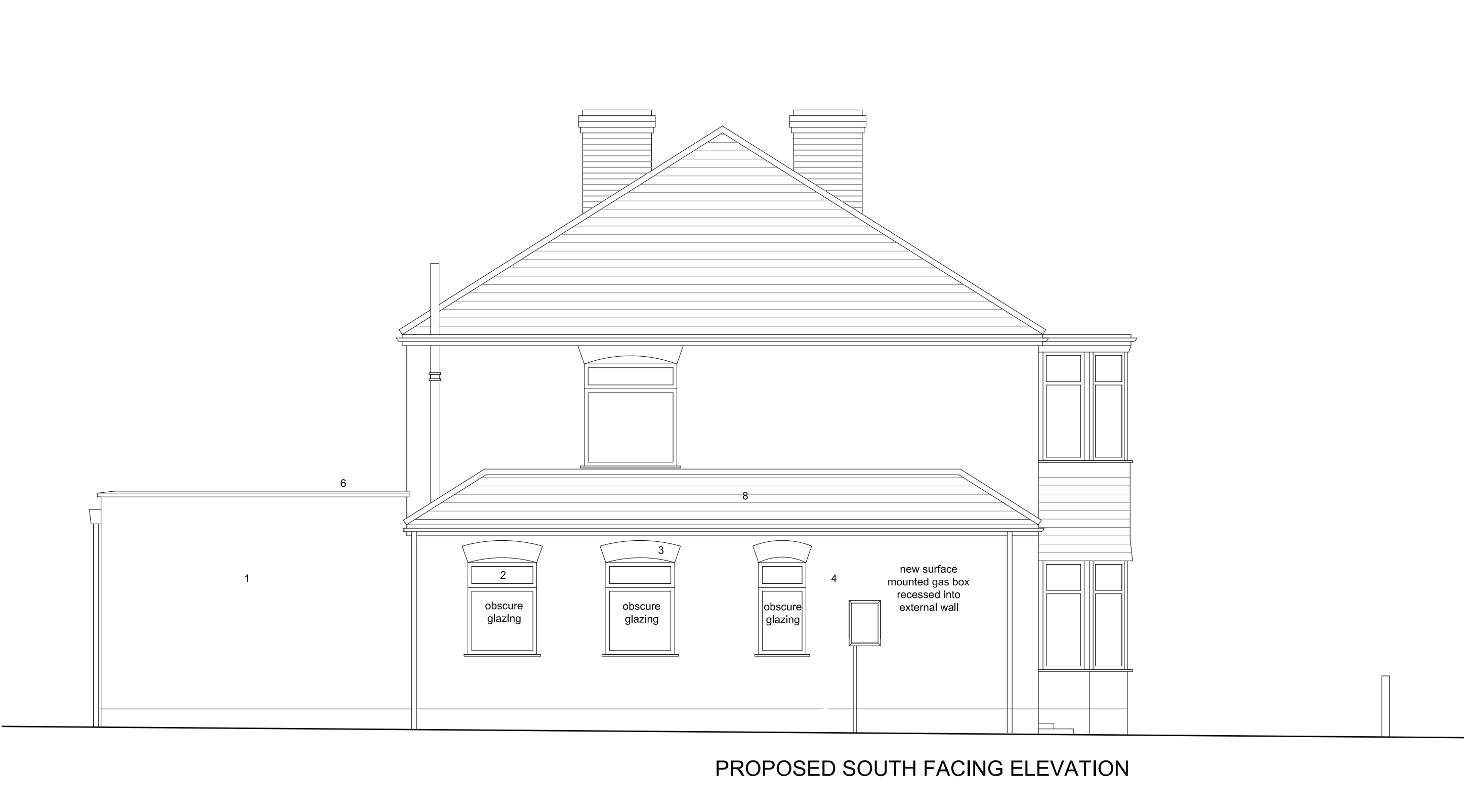
PROPOSED SOUTH FACING ELEVATION