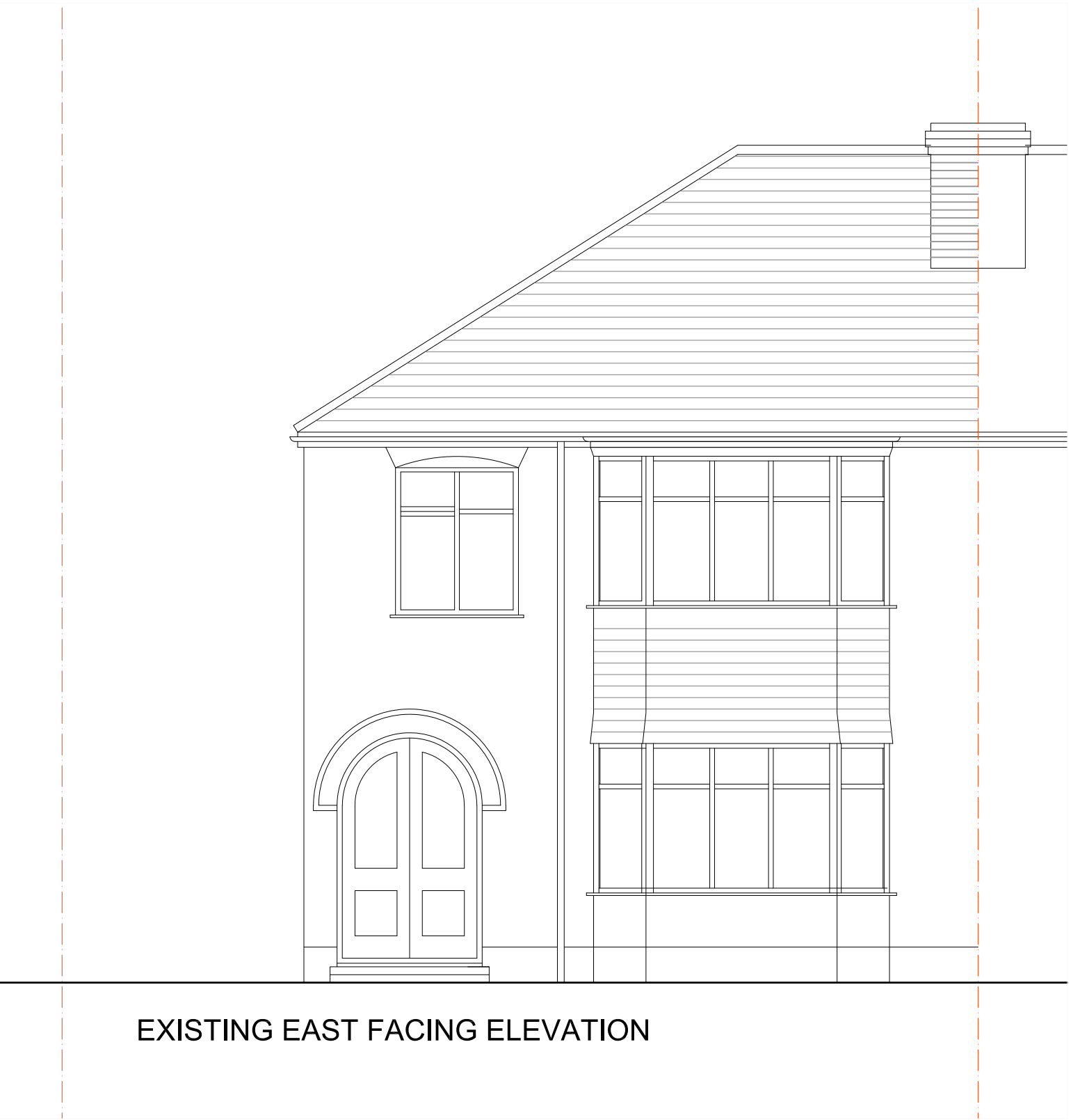
EXISTING EAST FACING ELEVATION