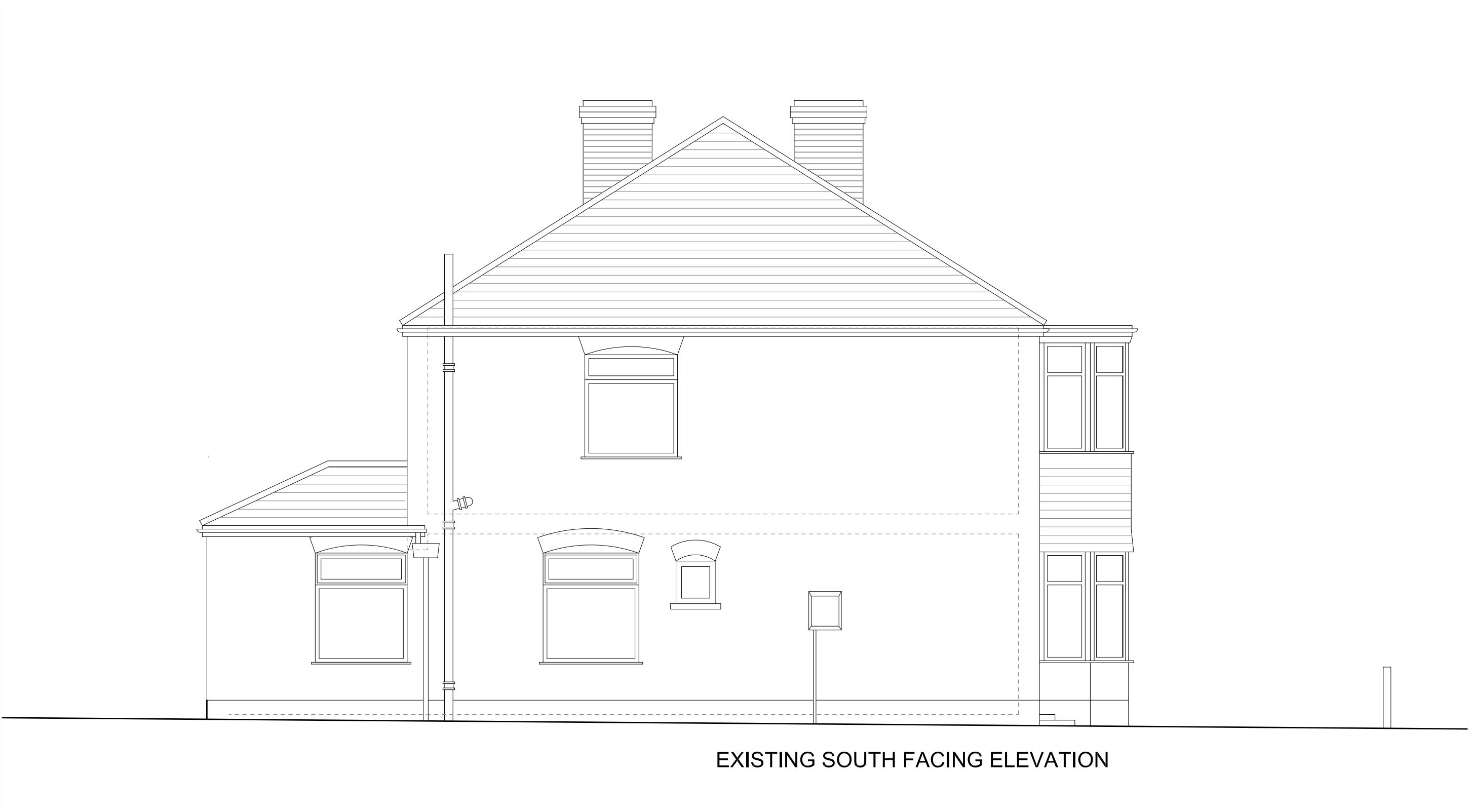
EXISTING SOUTH FACING ELEVATION