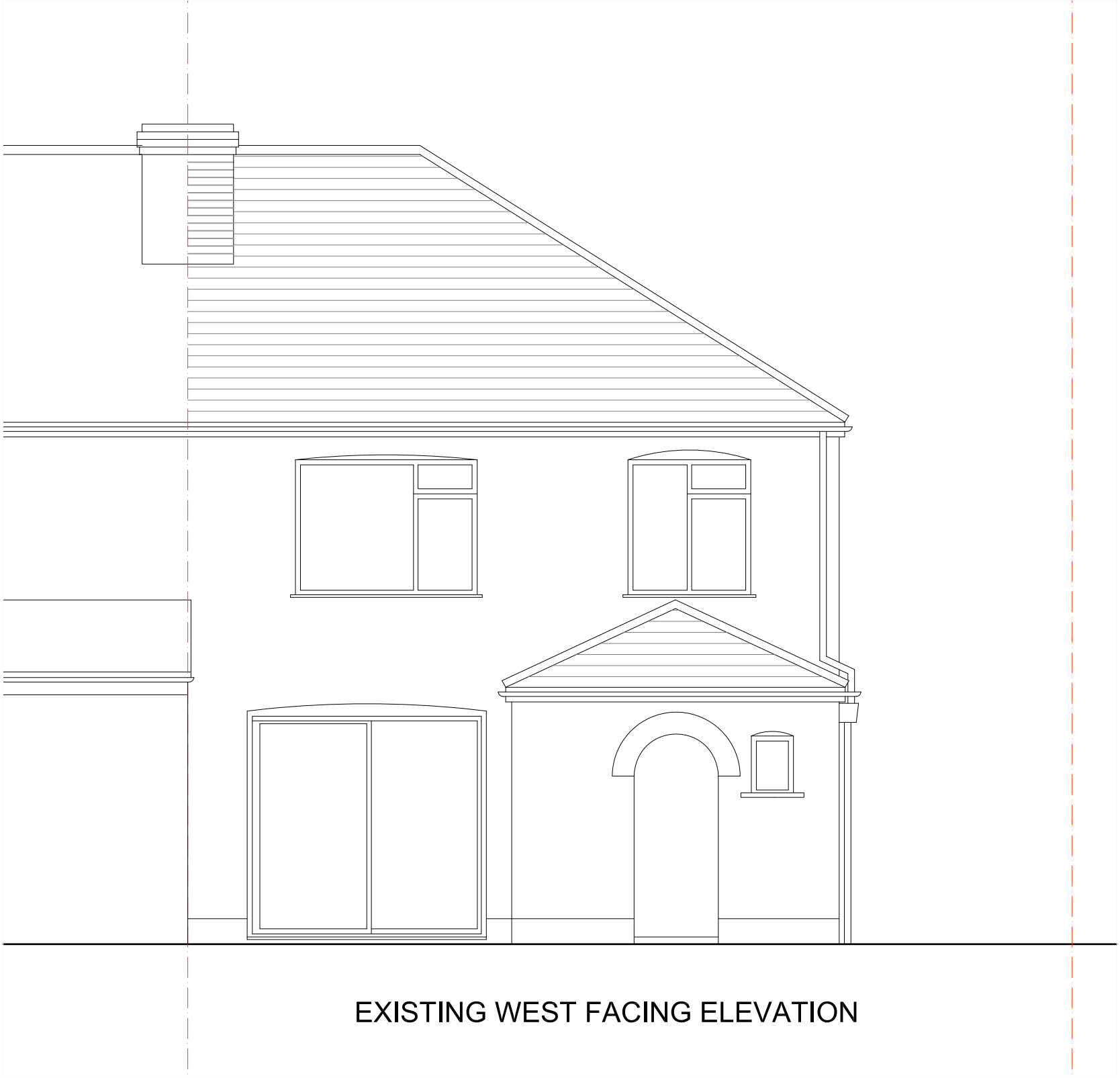
EXISTING WEST FACING ELEVATION