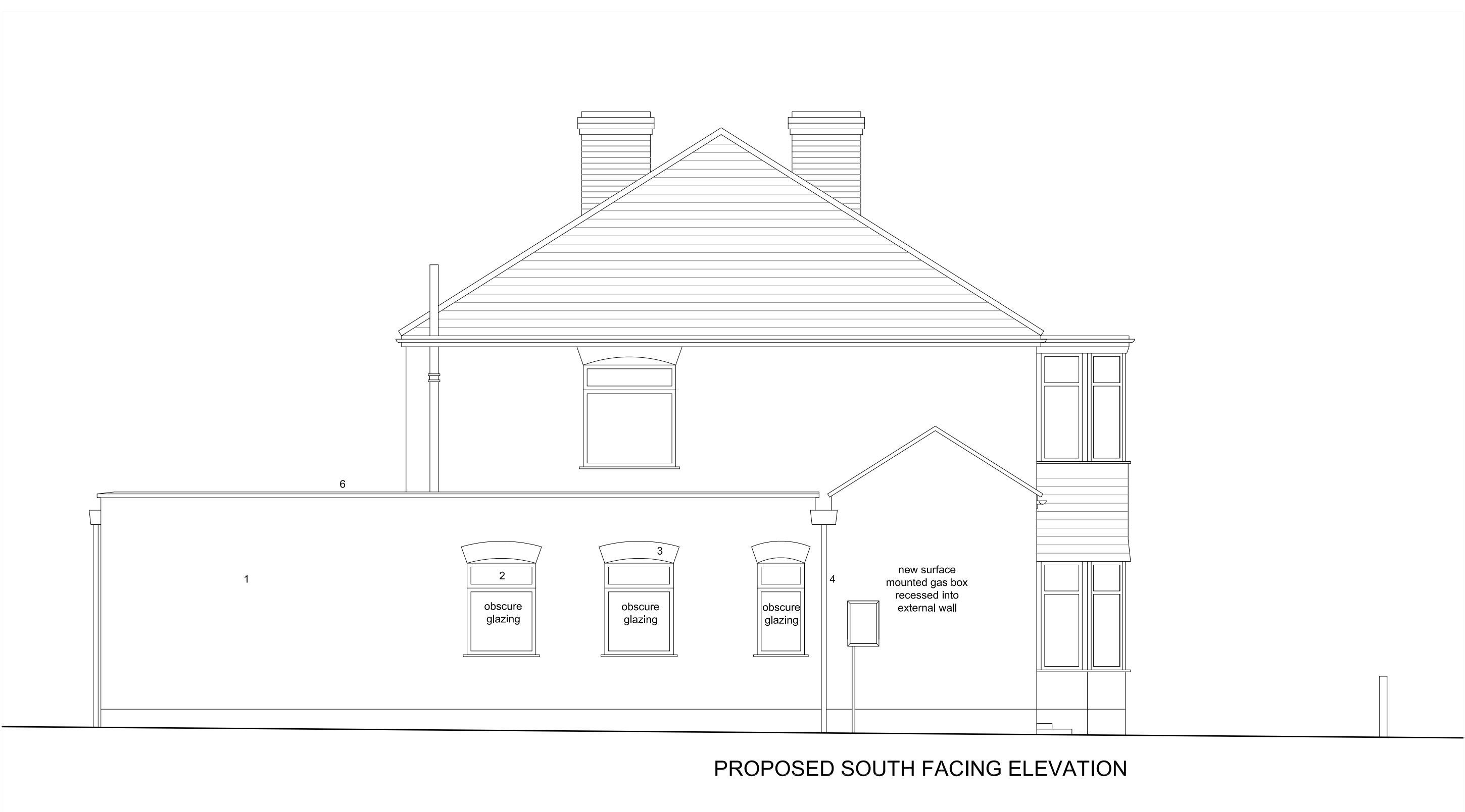
PROPOSED SOUTH FACING ELEVATION