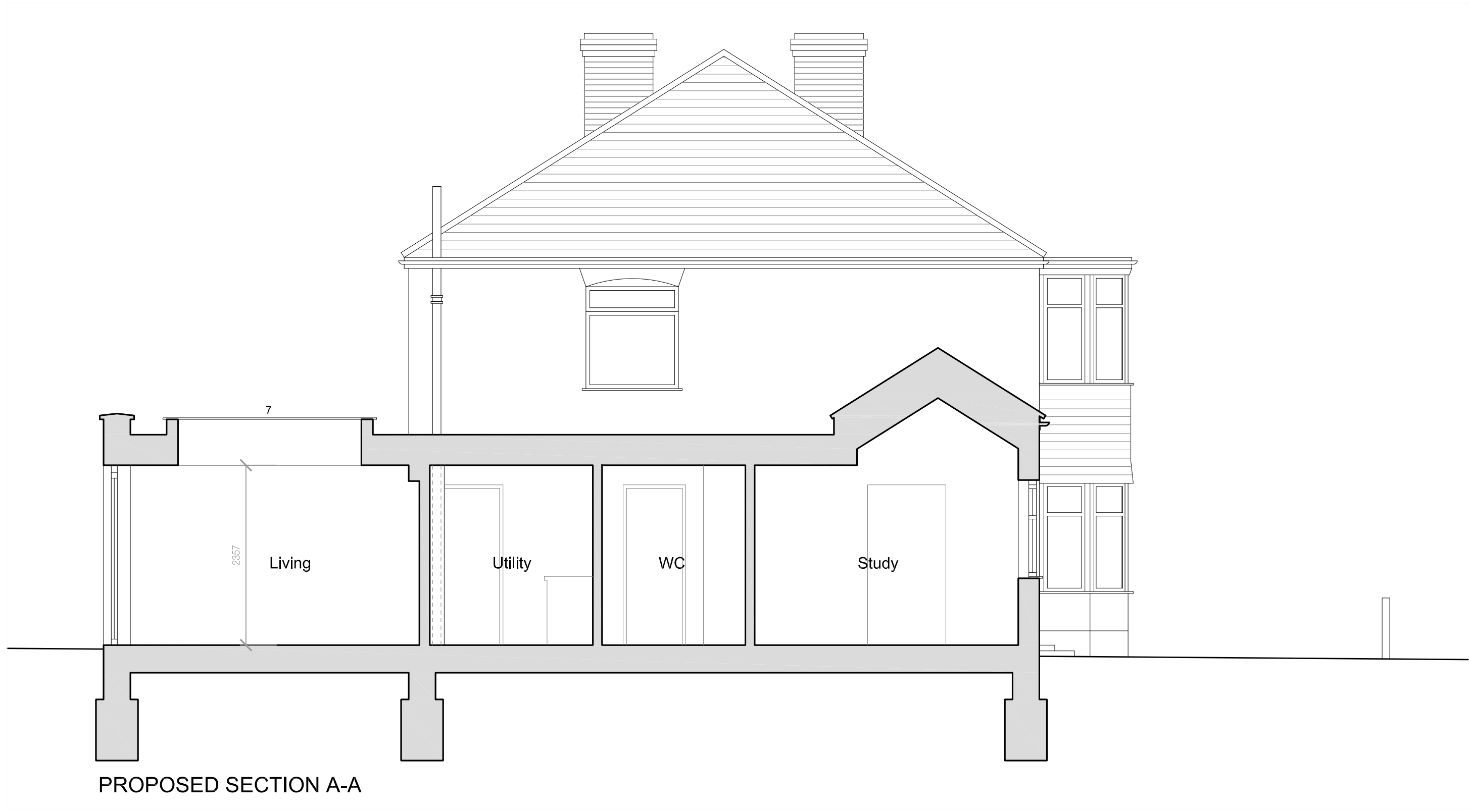
PROPOSED SECTION A-A