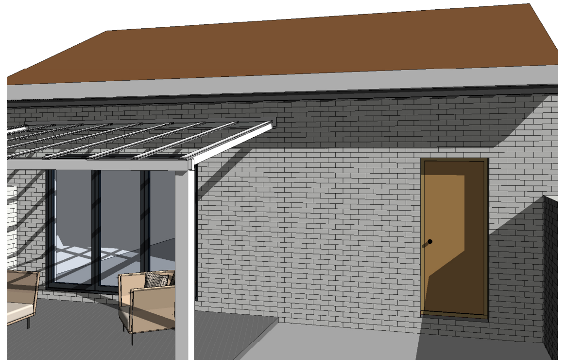
3 External View