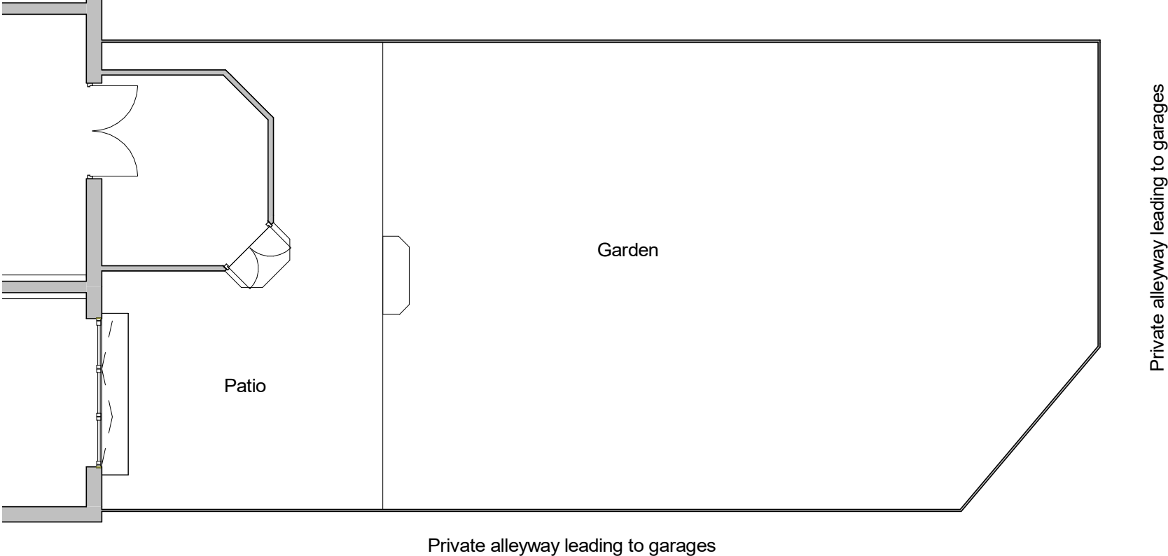
1 GF - Plan- Existing 1 : 100