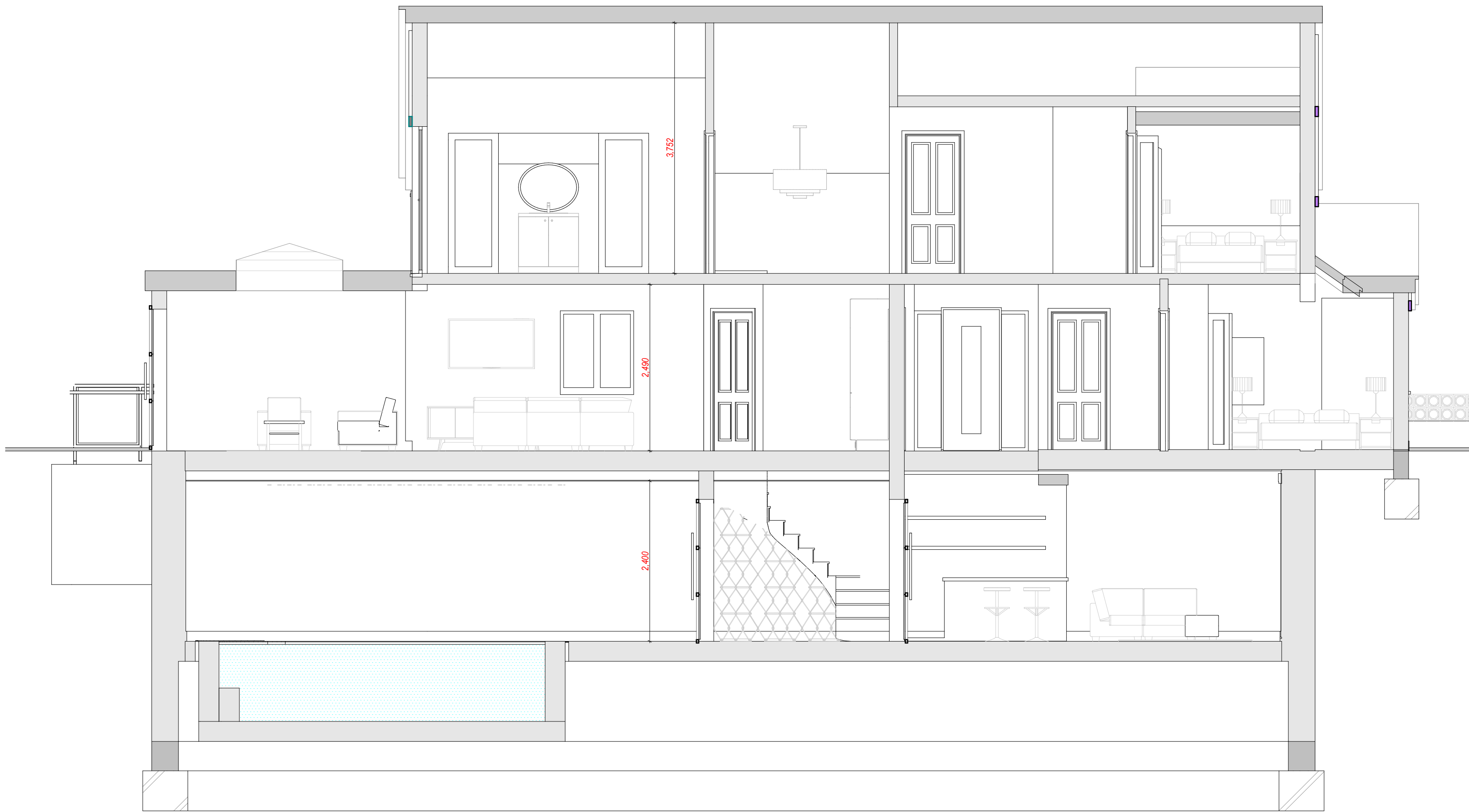
S-09 Building Section 1:50

© This drawing remains the property of The Keen Partnership and shall not be copied without prior written consent. All dimensions to be checked on site and any discrepancies to be reported before work commences.