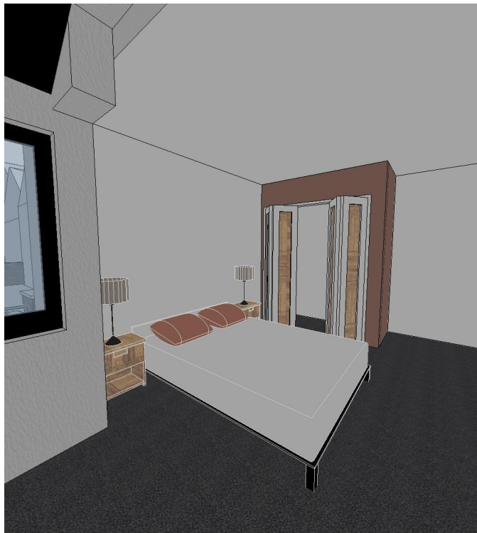
OFFICE/ BEDROOM 2