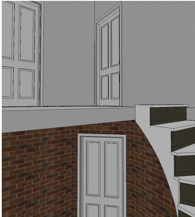
TOP OF STAIRS