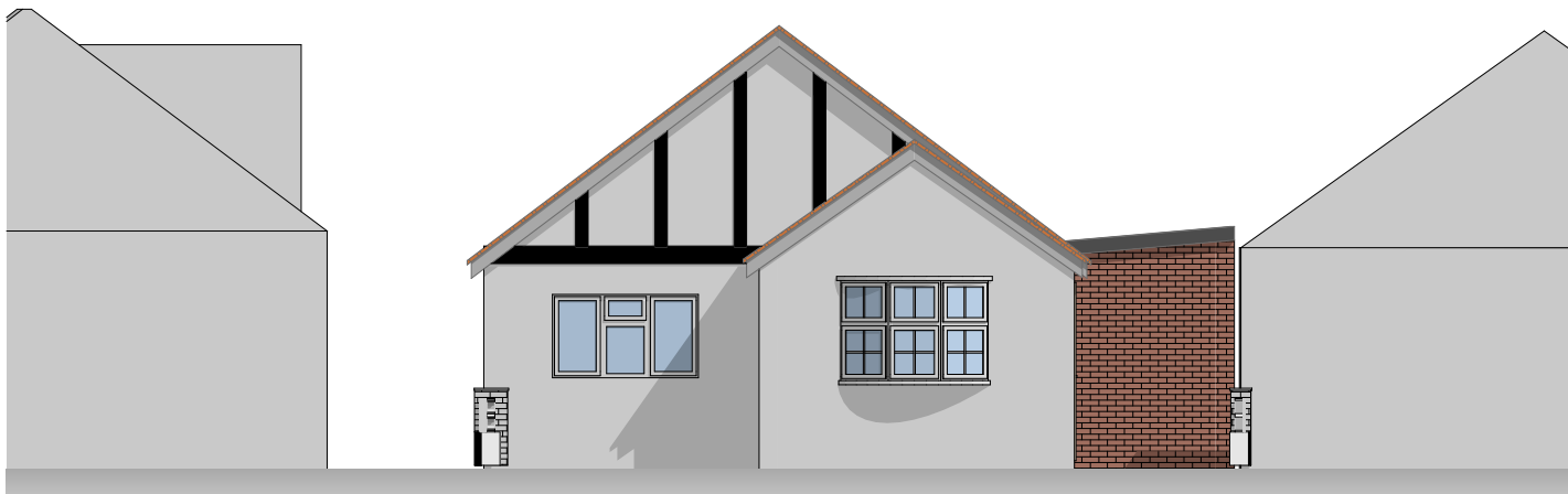
E-16 Existing Front Elevation 1:100

© This drawing remains the property of The Keen Partnership and shall not be copied without prior written consent. All dimensions to be checked on site and any discrepancies to be reported before work commences.