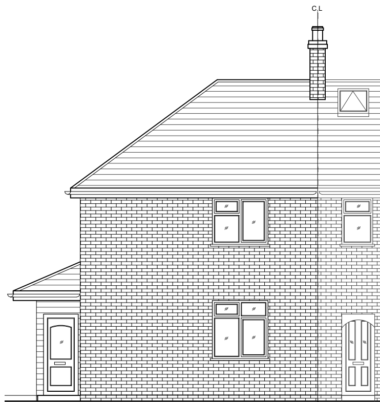
04 - FRONT ELEVATION