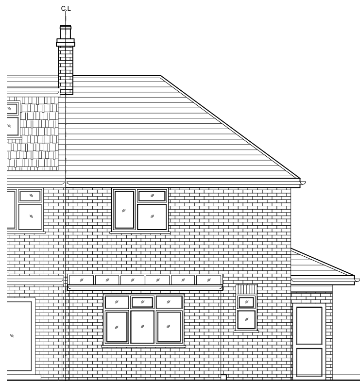
05 - REAR ELEVATION