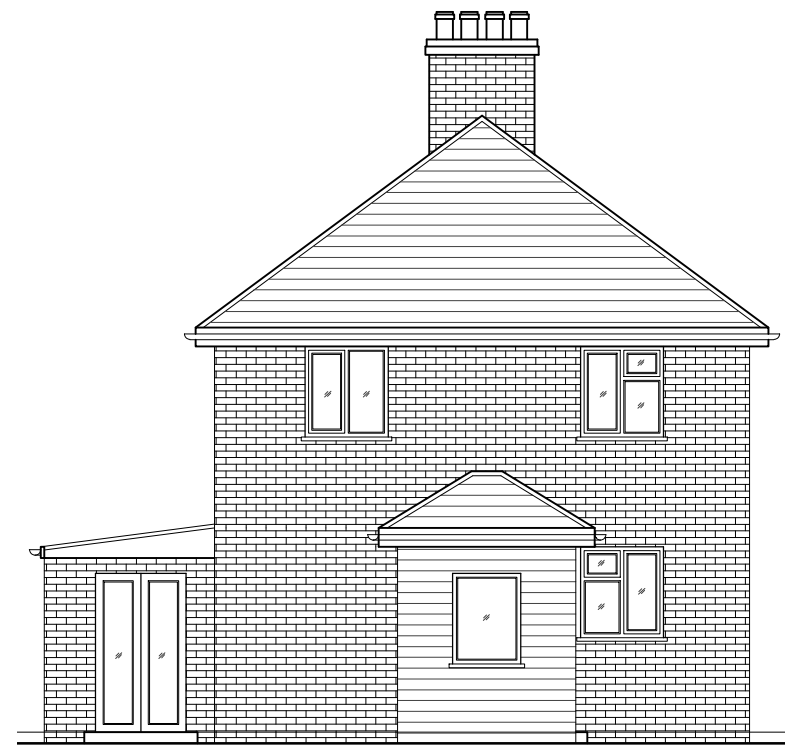
06 - SIDE ELEVATION