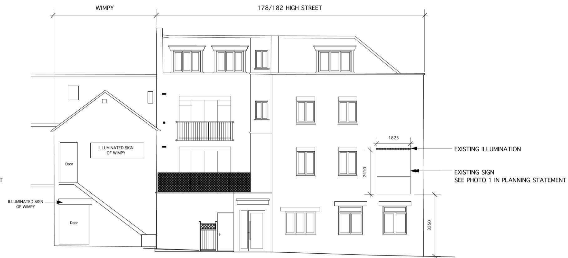
PRINCESS LANE ELEVATION SHOWING EXISTING SIGN THAT HAS BEEN REPLACED