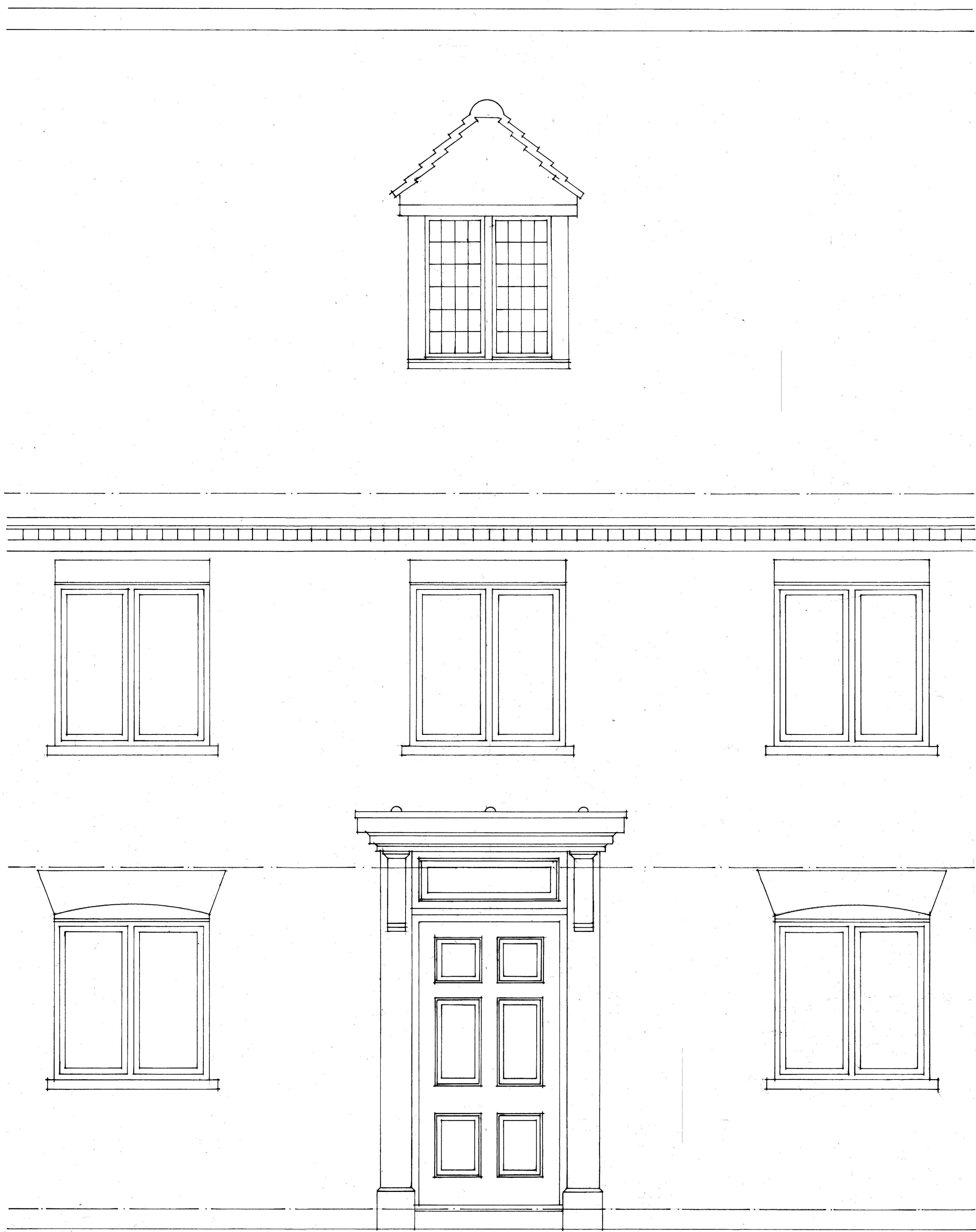
PART FRONT ELEVATION