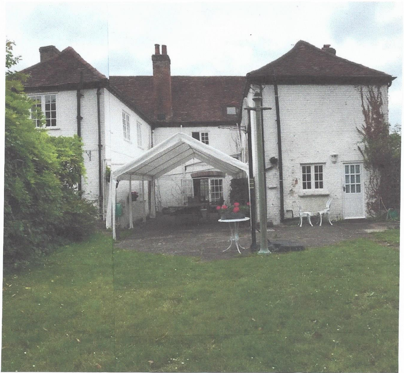
PAINTED BRICKWORK TO REAR AND COURTYARD ELEVATIONS.