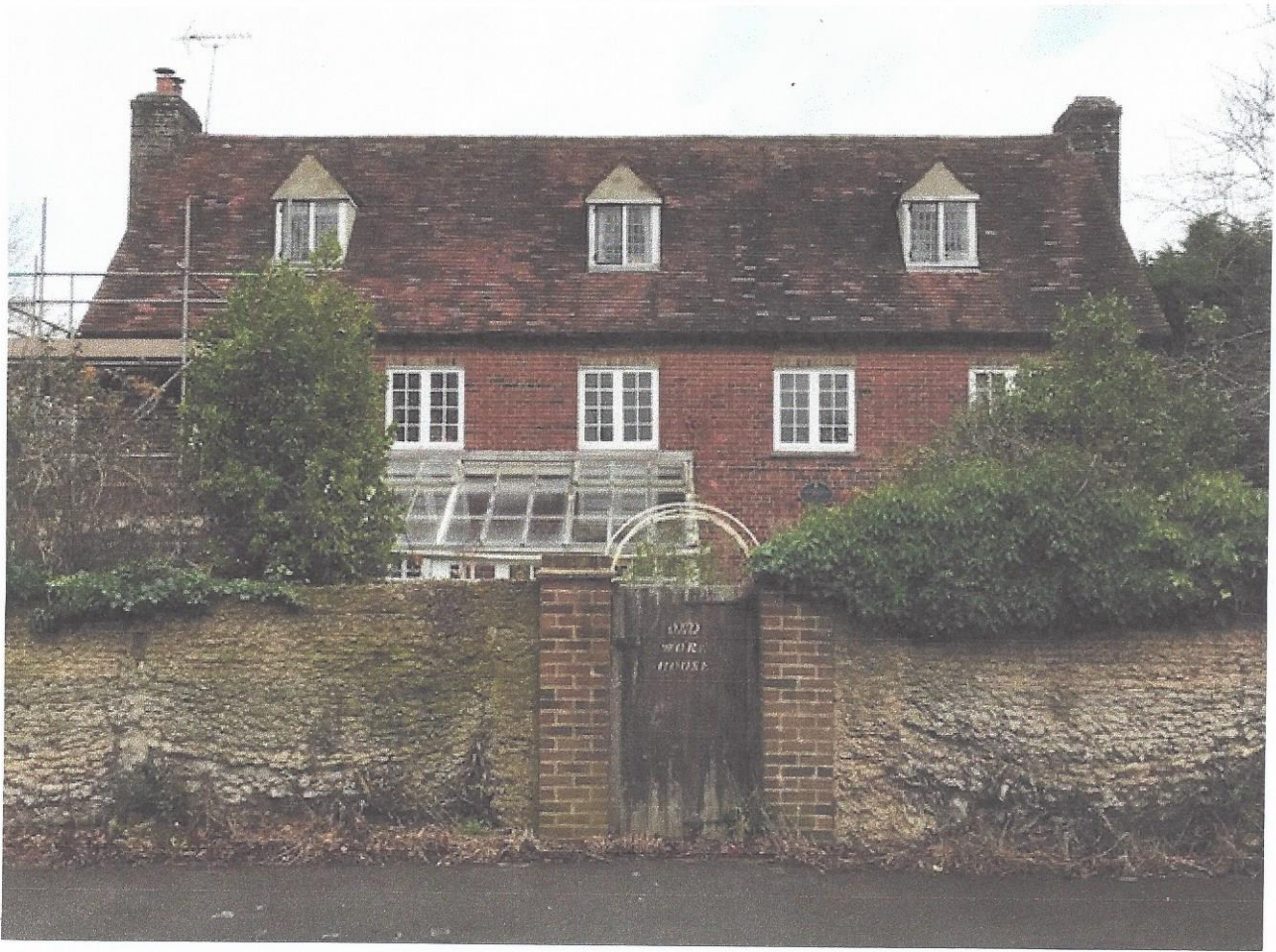
ROAD VIEW OF THE OLD WORKHOUSE.