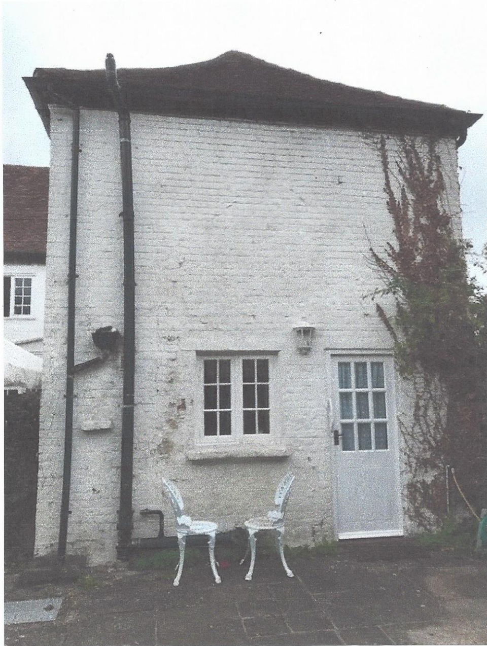
PAINTED SOFT, ERODED BRICKWORK TO REAR COURTYARD WING.