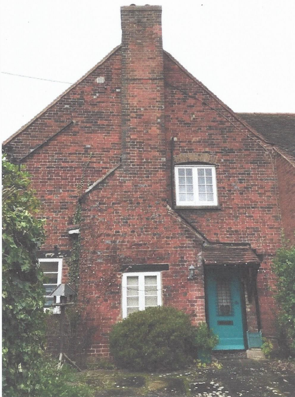
INAPPROPRIATE ENGINEERING BRICKS INSTALLED IN STACK, POOR CEMENT TILE ABUTMENT AND POINTING ON EAST SIDE OF HOUSE.