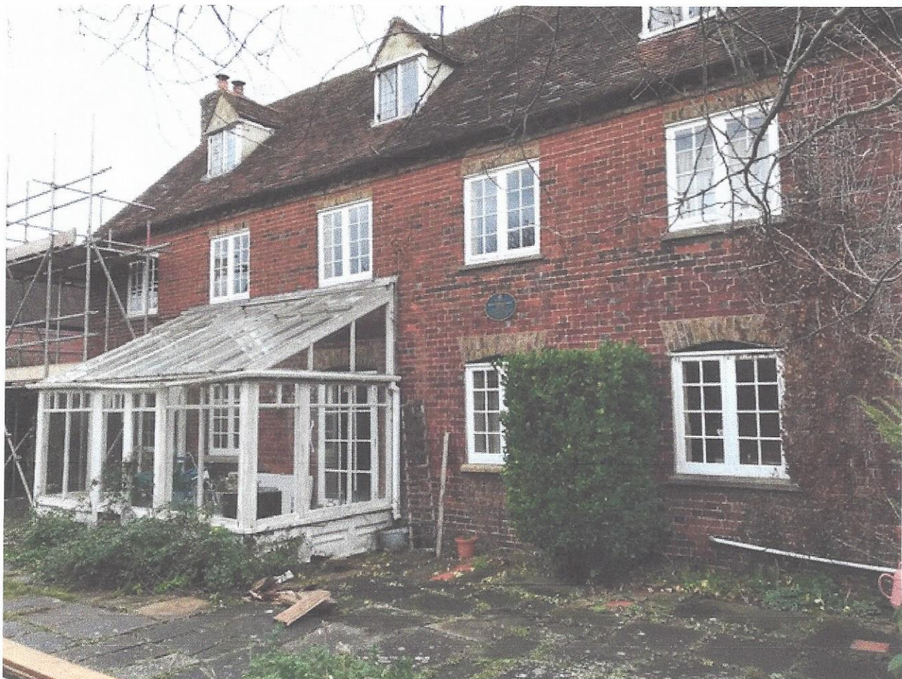
FRONT VIEW OF HOUSE WITH DILAPIDATED TIMBER CONSERVATORY.