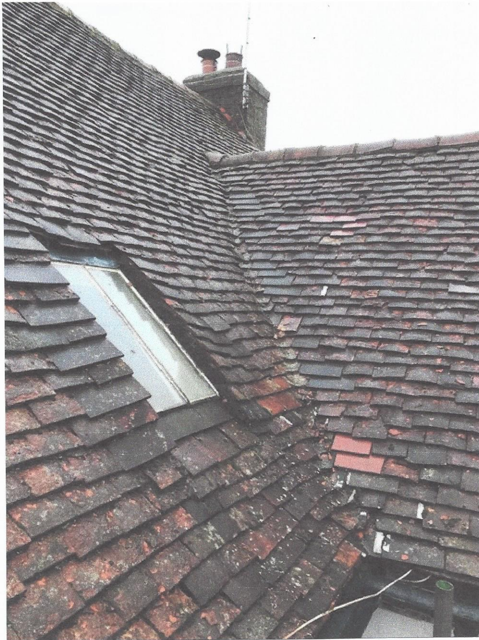
COURTYARD VALLEY AND ROOFLIGHT.