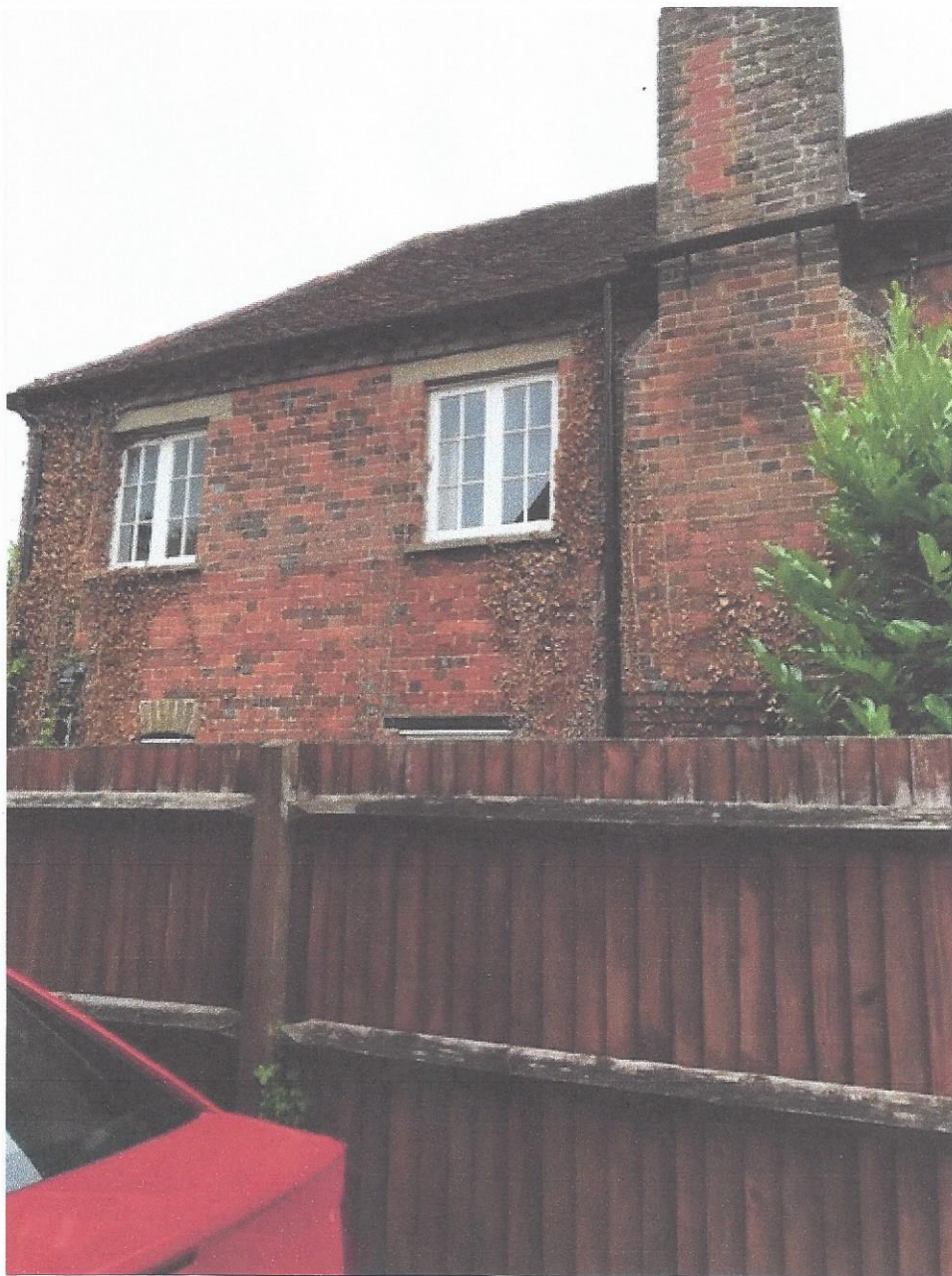
INAPPROPRIATE ENGINEERING BRICKS INSTALLED IN CHIMNEY STACK ON WEST SIDE OF HOUSE.