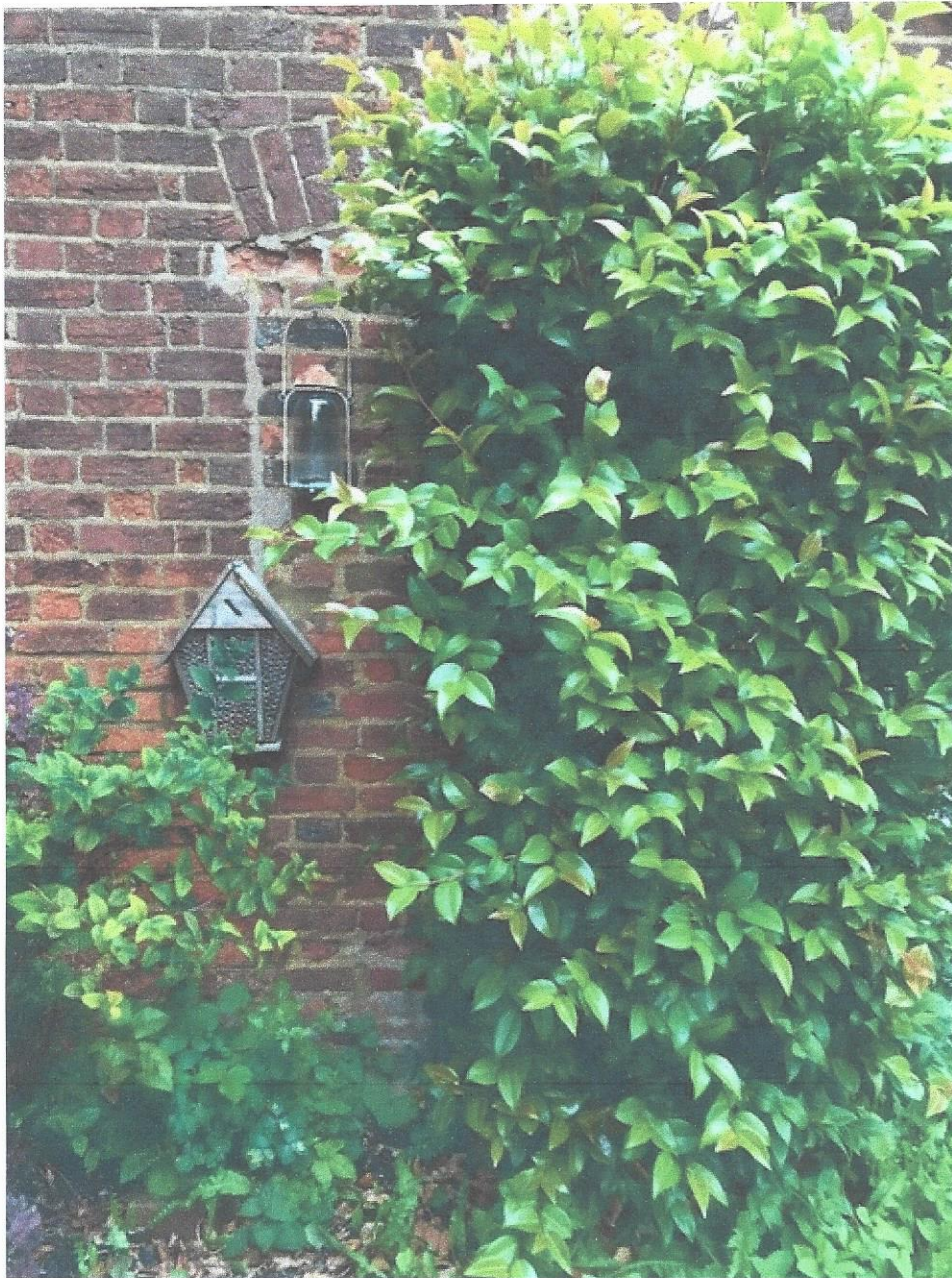
POOR CEMENT POINTING AND ERODED BRICKWORK TO INFILLED WINDOW OPENING ON EAST SIDE OF HOUSE.