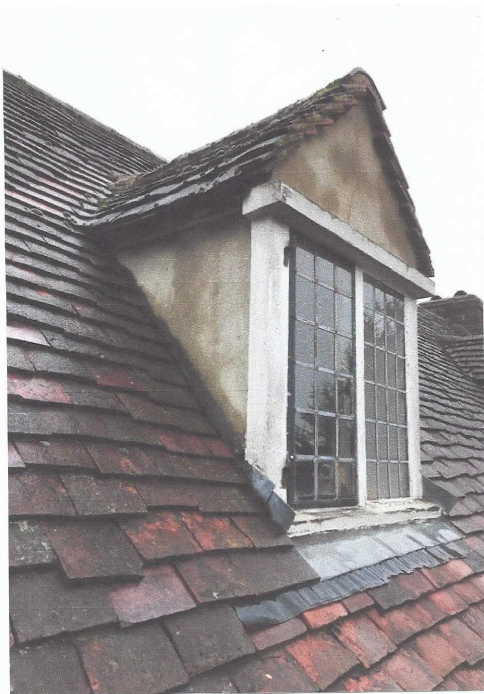
DORMER WITH CRACKED RENDER AND WINDOW REQUIRING OVERHAULING, NEW GLAZED CASEMENT WINDOW AND REDECORATION .