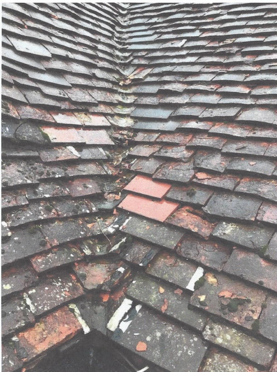
COURTYARD VALLEY AND ADJACENT TILING.