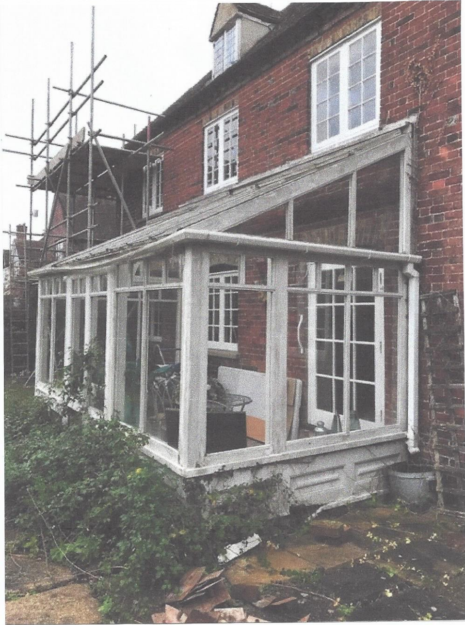
DILAPIDATED TIMBER CONSERVATORY TO FRONT OF HOUSE.