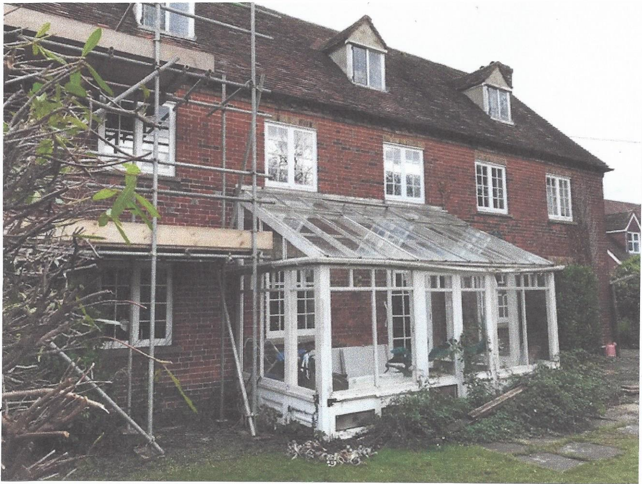
FRONT VIEW OF HOUSE WITH DILAPIDATED TIMBER CONSERVATORY.