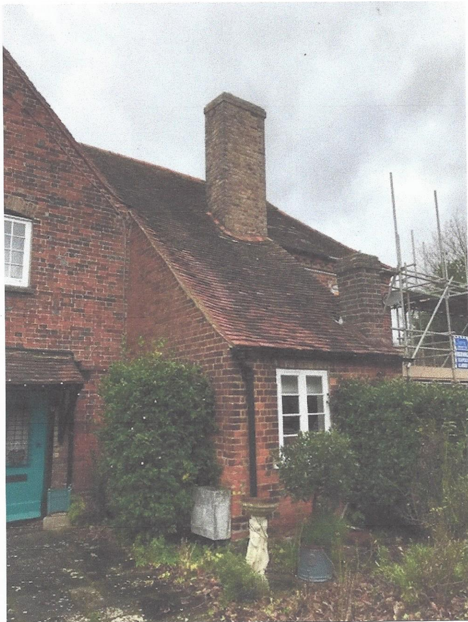
CAT-SLIDE ADDITION WITH LEANING CHIMNEY STACK ON EAST SIDE OF HOUSE.