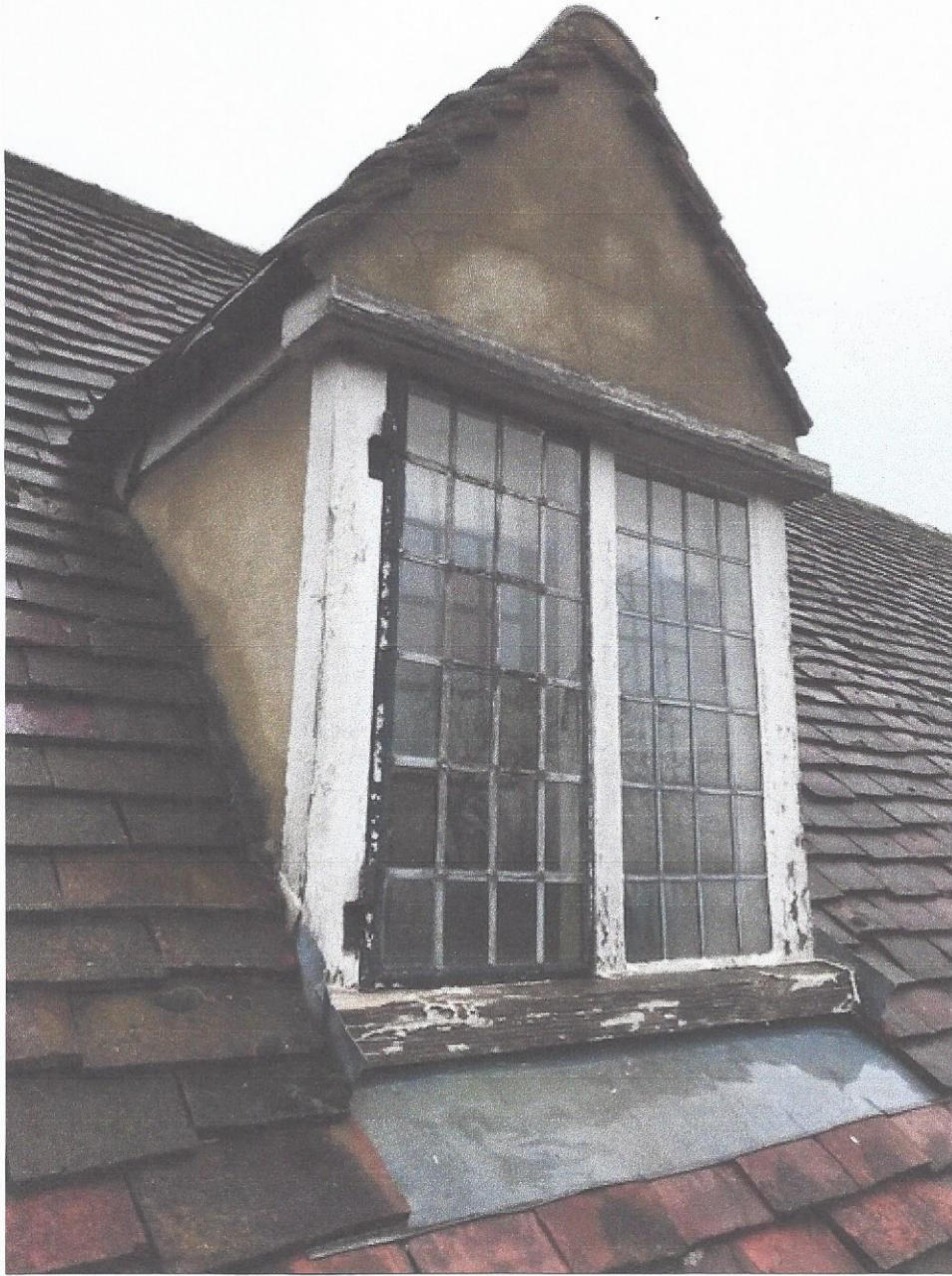
DORMER WITH CRACKED RENDER AND WINDOW REQUIRING OVERHAULING AND REDECORATION.