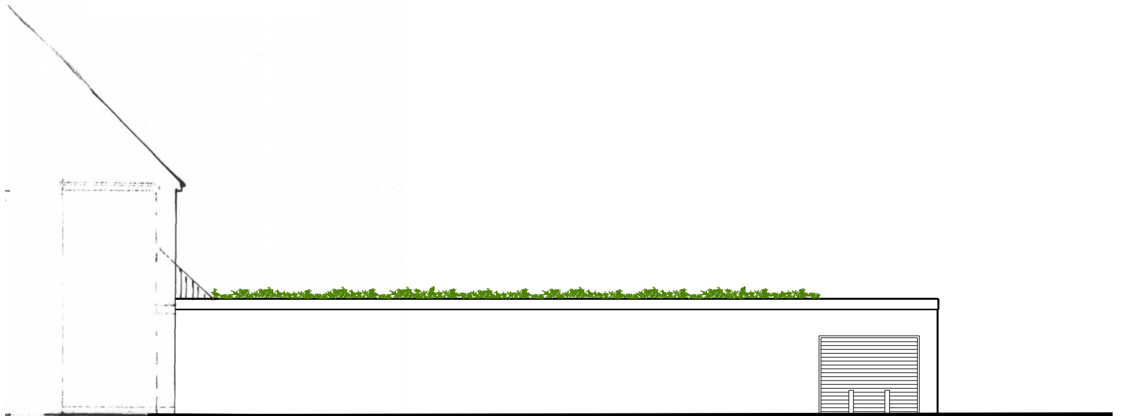
02 PROPOSED SIDE ELEVATION SCALE 1:100