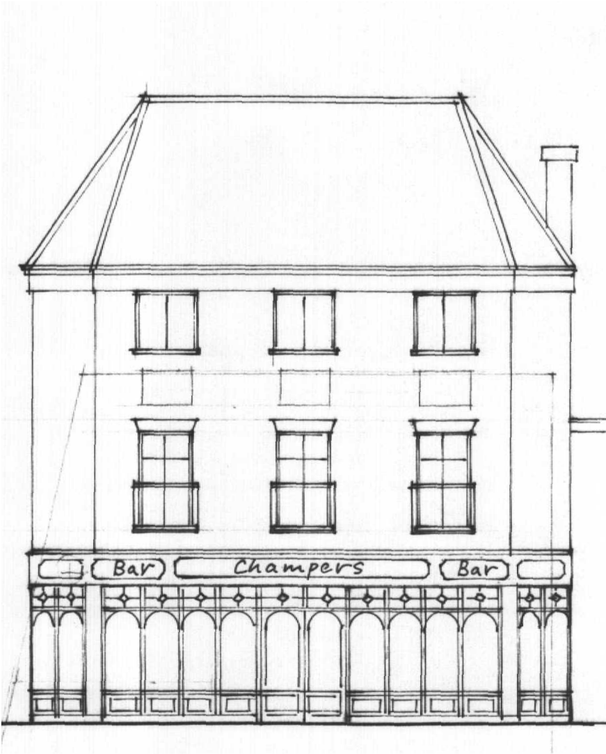
01 PROPOSED FRONT ELEVATION SCALE 1:100

NOTES: All construction to comply with all relevant and current building regulations. For building regulation compliance please refer building regulation/ structural engineers drawing. All Dimensions to be measured by contractor on site prior to construction. Not for construction.