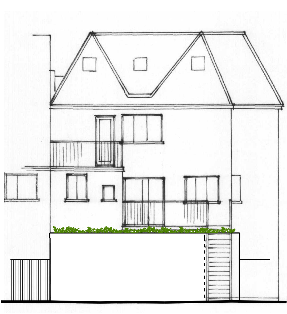
02 PROPOSED REAR ELEVATION SCALE 1:100