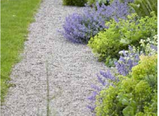
LOSE GRAVEL TO FOOTPATH AROUND BUILDINGS