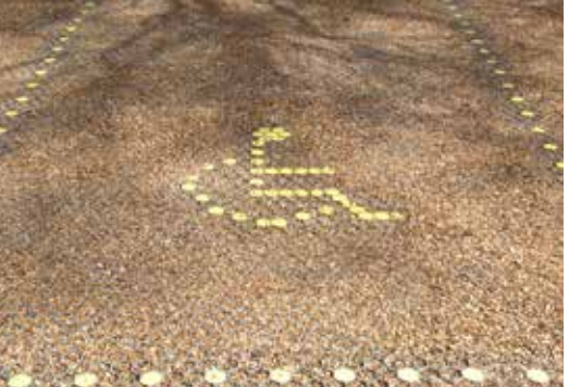
REINFORCED GRAVEL TO DDA PARKING WITH YELLOW INSERTS FOR DEMARCATION