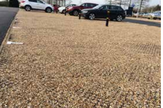
REINFORCED GRAVEL TO CAR PARKING SPACES