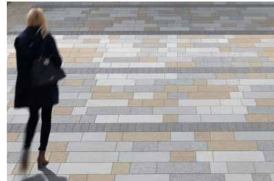
CONCRETE PAVING TO COURTYARD GARDEN