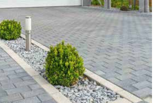
CONCRETE BLOCK PAVING TO PRIVATE DRIVE WAY AND PARKING