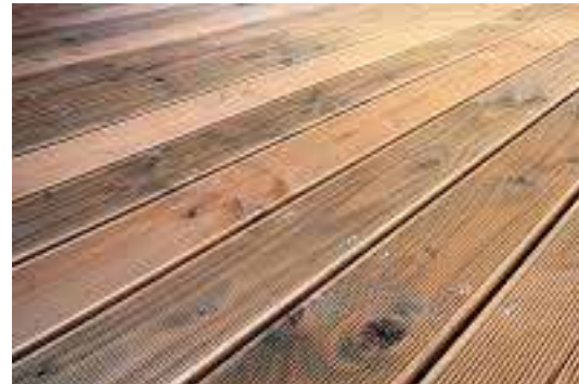
TIMBER DECKING FOR SOME SEATING AREAS IN THE GARDEN