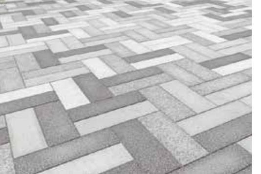
CONCRETE BLOCK PAVING TO RAISED PEDESTRIAN CROSSING BETWEEN COURTYARD & KITCHEN GARDEN