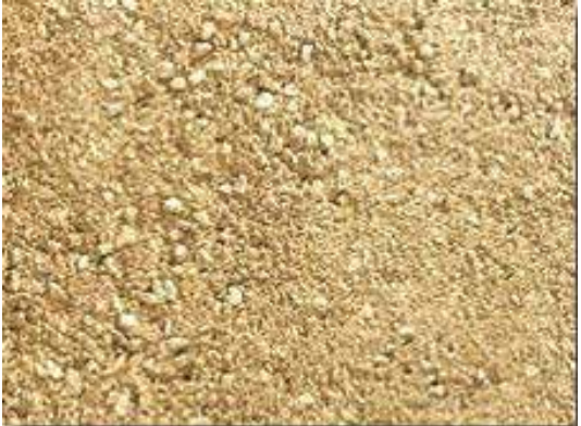
SELF-BINDING BREEDON GOLDEN AMBER GRAVEL FOR SECONDARY ROADS AND MANSION DROPP OFF