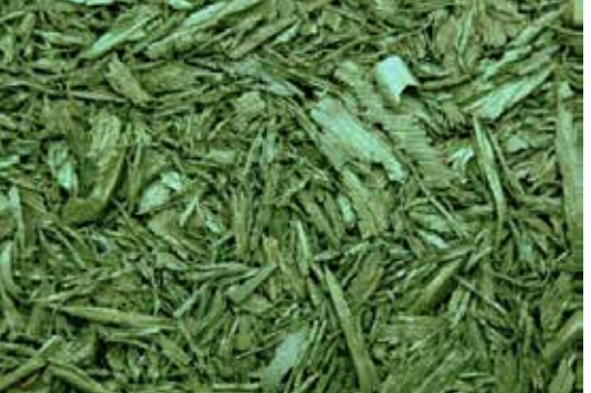
DARK GREEN BOUND RUBBER BARK / GRASS MATS UNDER AND AROUND THE PLAY EQUIPMENT AS ADVISED BY SPECIALIST