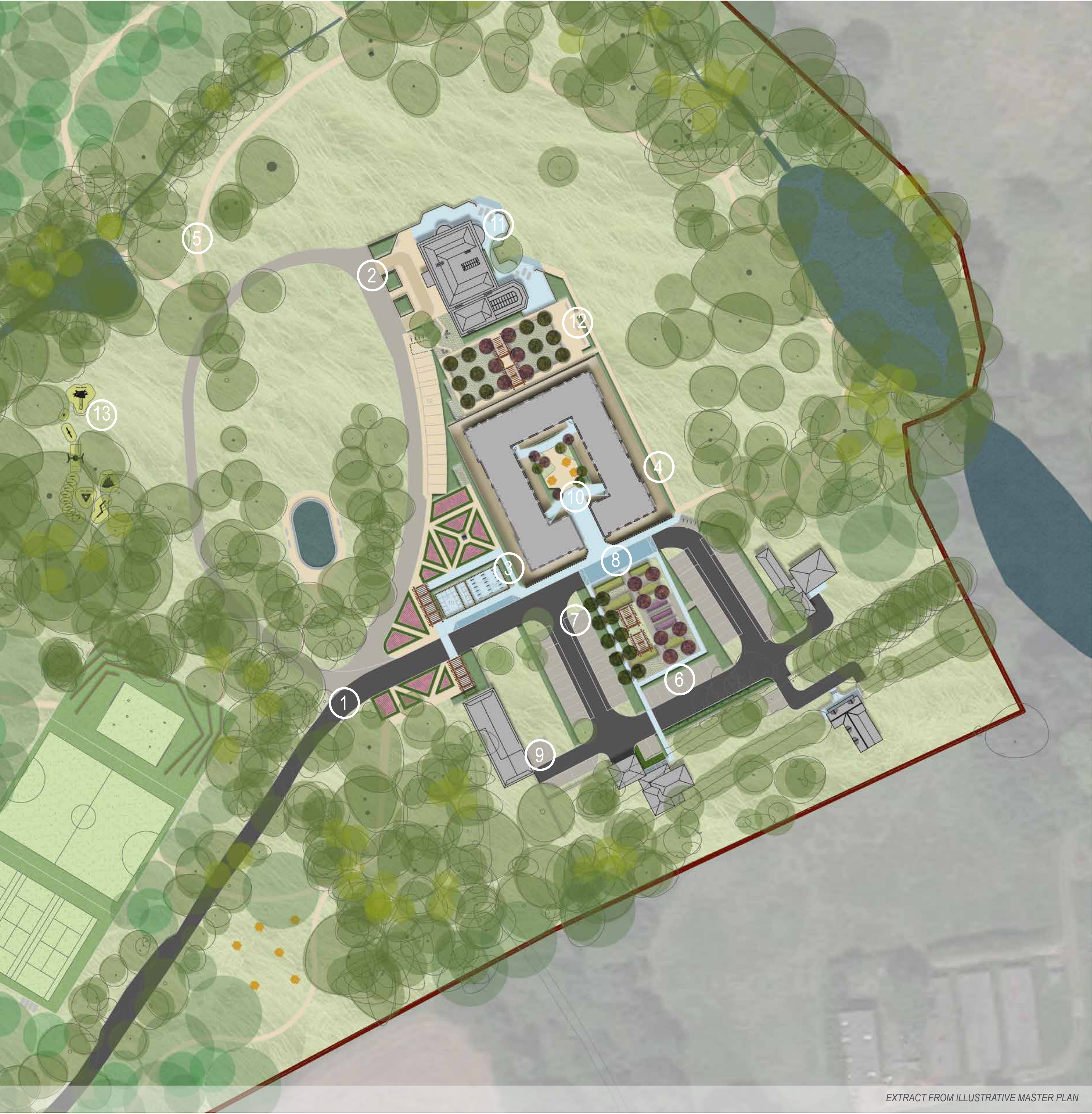
EXTRACT FROM ILLUSTRATIVE MASTER PLAN