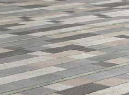
CONCRETE BLOCK PAVING TO MAIN PEDESTRIAN