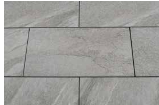
PORCELAIN TILES FOR MANSION TERRACE