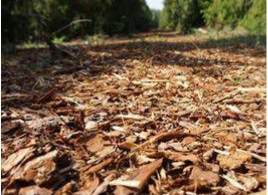
BARK TO FOOTPATH IN THE WOODLAND