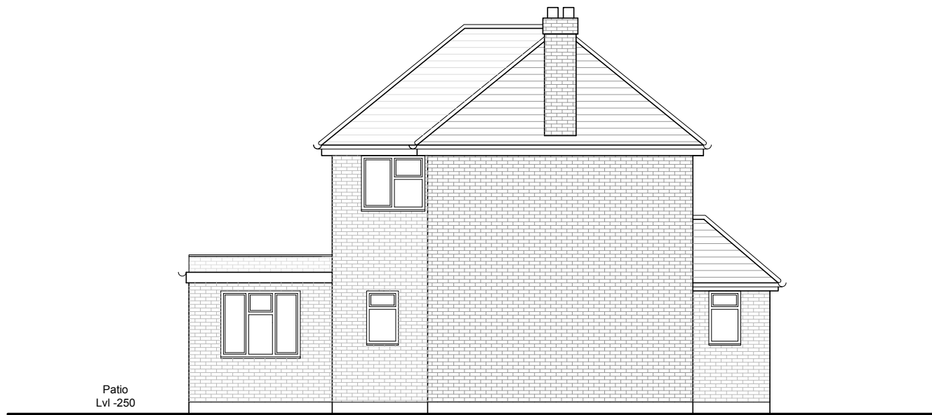
EXISTING SIDE (LHS) ELEVATION